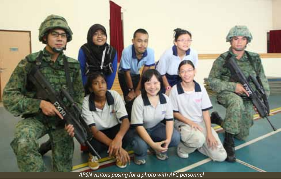
APSN visitors posing for a photo with AFC personnel