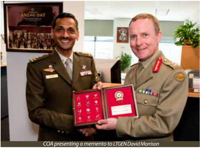
COA presenting a memento to LTGEN David Morrison