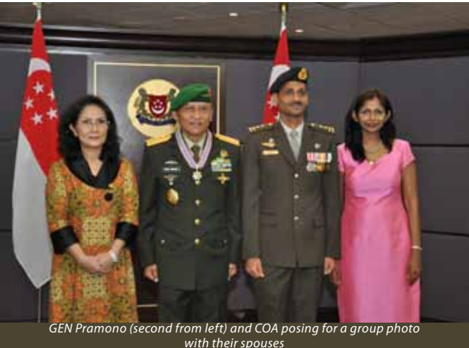
GEN Pramono (second from left) and COA posing for a group photo with their spouses