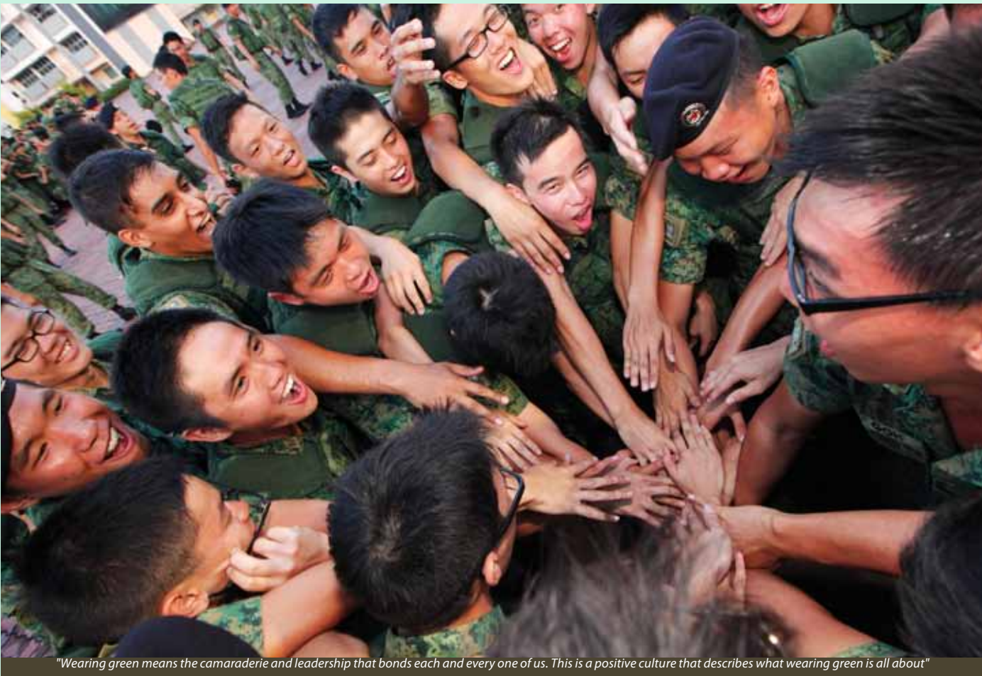
"Wearing green means the camaraderie and leadership that bonds each and every one of us. This is a positive culture that describes what wearing green is all about."