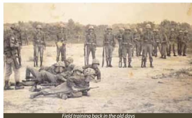
Field training back in the old days