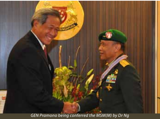
GEN Pramono being conferred the MSM(M) by Dr Ng