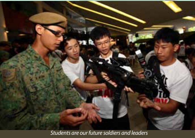
Students are our future soldiers and leaders

This year, we will commemorate 45 years of NS with the theme "Celebrating 45 years of National Service: From Fathers to Sons". We have enlisted 900,000 NSmen over the past 45 years. Today, the majority of our NSFs have fathers who have themselves served NS. We have lined up a series of celebrations throughout the year (see page 11 & 12 for details).