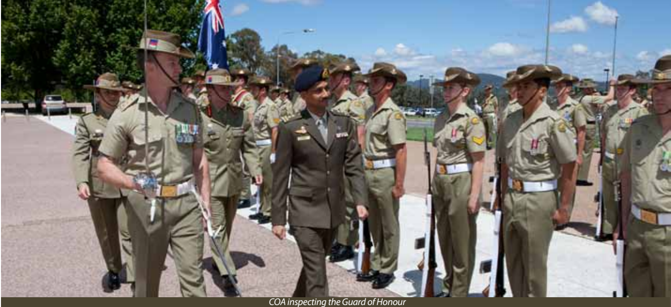
COA inspecting the Guard of Honour

Story and photography contributed by COA Office