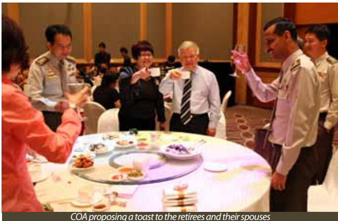
COA proposing a toast to the retirees and their spouses