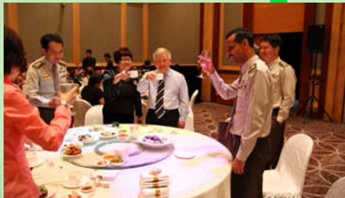
Recognising our Retirees' Contributions 9