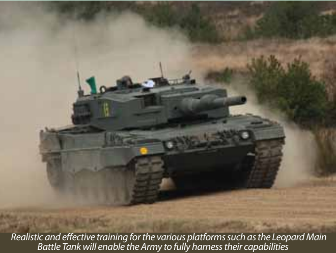
Realistic and effective training for the various platforms such as the Leopard Main Battle Tank will enable the Army to fully harness their capabilities

To enhance our training facilities, advanced targetry systems will be constructed in live-firing areas. Murai Urban Training Facility (MUTF) will also be enhanced to sharpen soldiers' skills through live-firing. Going ahead, the Army will also introduce better designed battle circuits to transform our local training land. Increasingly, recruits also will train with Tactical Engagement System (TES) to start them off with correct tactical behaviours and instincts.