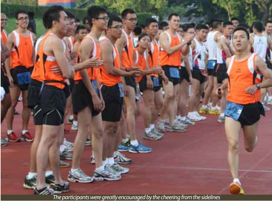
The participants were greatly encouraged by the cheering from the sidelines

Story by Shawn Tay