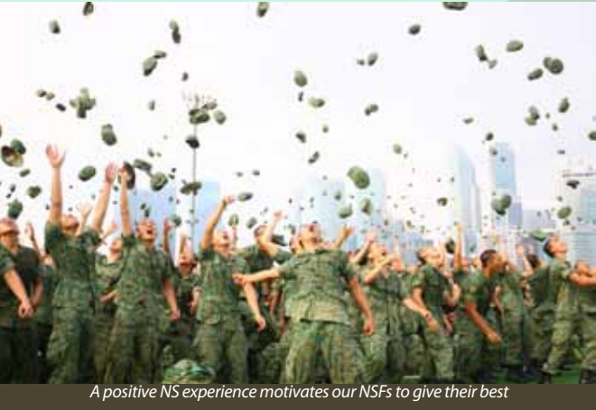
A positive NS experience motivates our NSFs to give their best

c. Coach, motivate and inspire. All leaders must make training meaningful, purposeful and engaging.