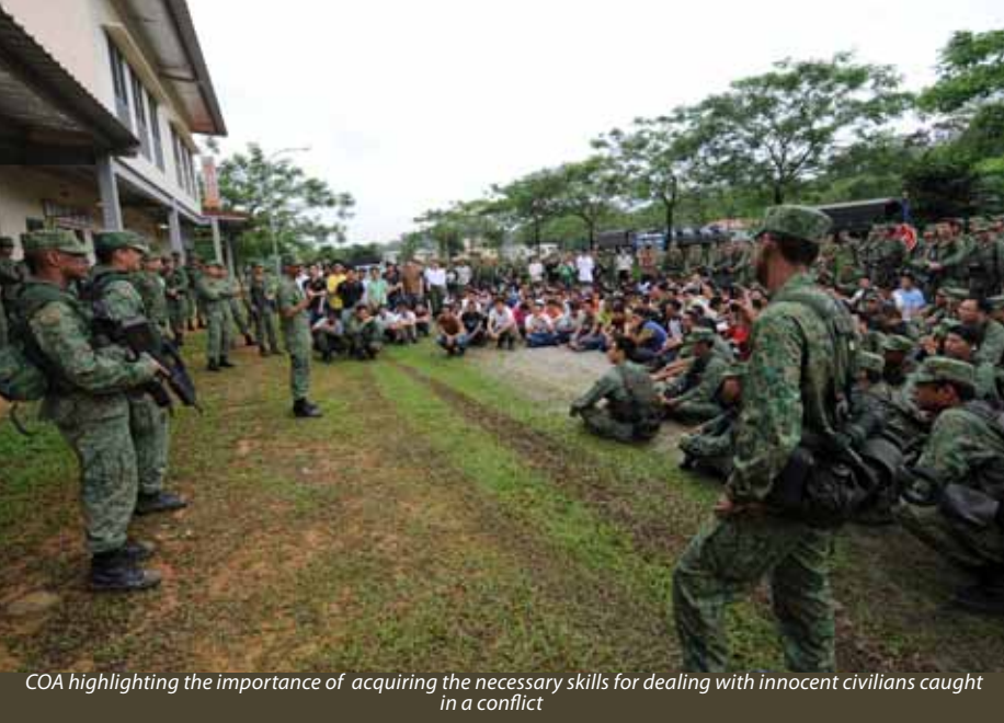
COA highlighting the importance of acquiring the necessary skills for dealing with innocent civilians caught in a conflict