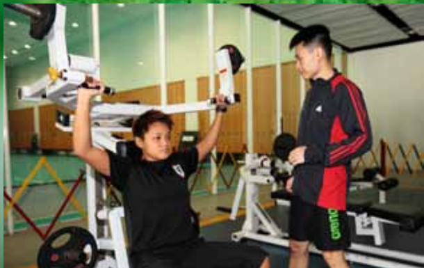
Army Regulars Studying in RP Help to Boost Students' Fitness 2