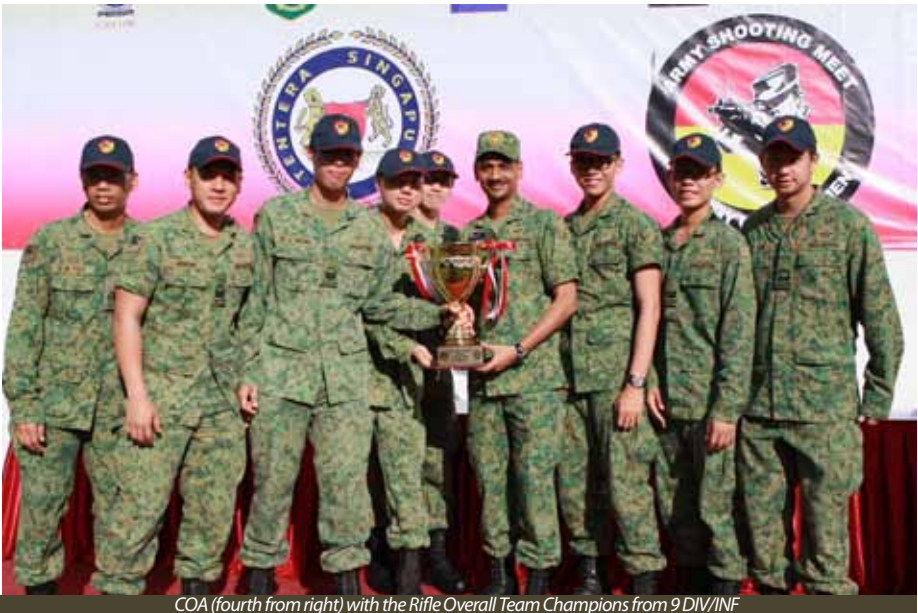
COA (fourth from right) with the Rifle Overall Team Champions from 9 DIV/INF

Story by Bjorn Teo