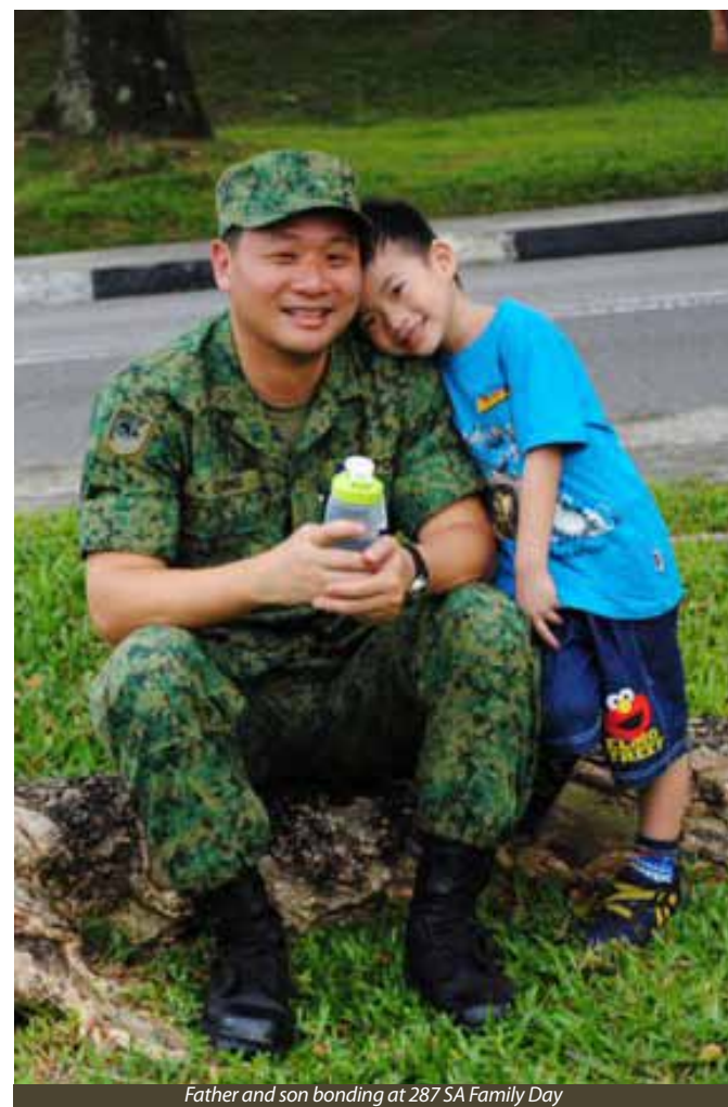
Father and son bonding at 287 SA Family Day