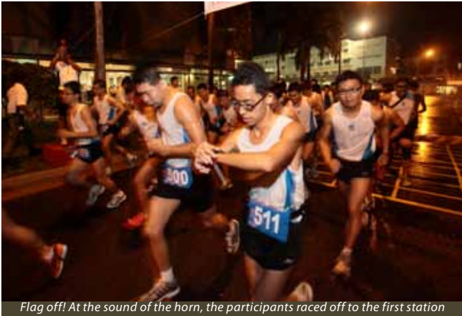
Flag off! At the sound of the horn, the participants raced off to the first station

Story by Shawn Tay