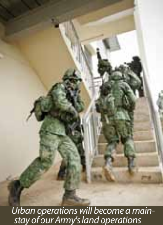
Urban operations will become a mainstay of our Army's land operations

At last year's Planning Seminar, the Army Leadership came together to take stock of our achievements in the first spiral and chart the way forward for the second spiral. The Leadership agreed on the need to focus even more on our people while we continue to build a more ready and capable Army. As part of the process in developing a new vision for the Army, we engaged our active and NS soldiers and commanders, identified the key elements that resonated very strongly across the Army, and finally crystallised the new Army vision: