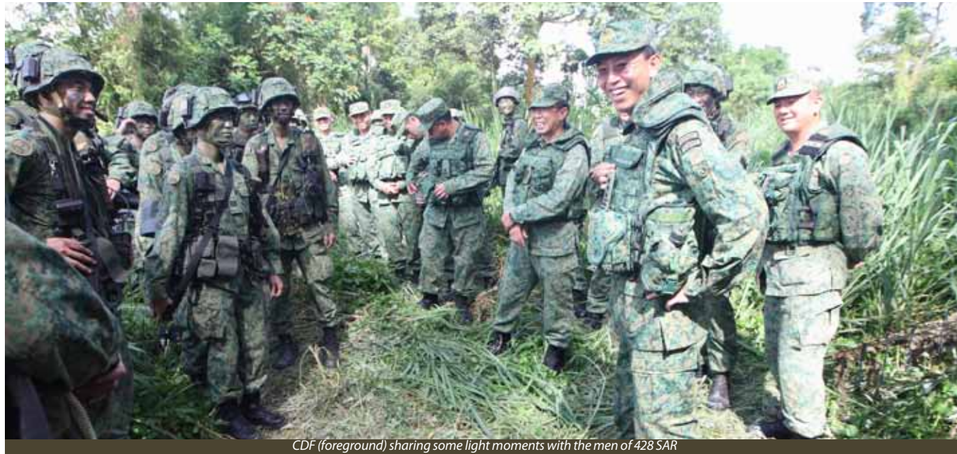
CDF (foreground) sharing some light moments with the men of 428 SAR

On 2 March, Chief of Defence Force (CDF), LG Neo Kian Hong, visited the Central Manpower Base (CMPB) in Depot Road.