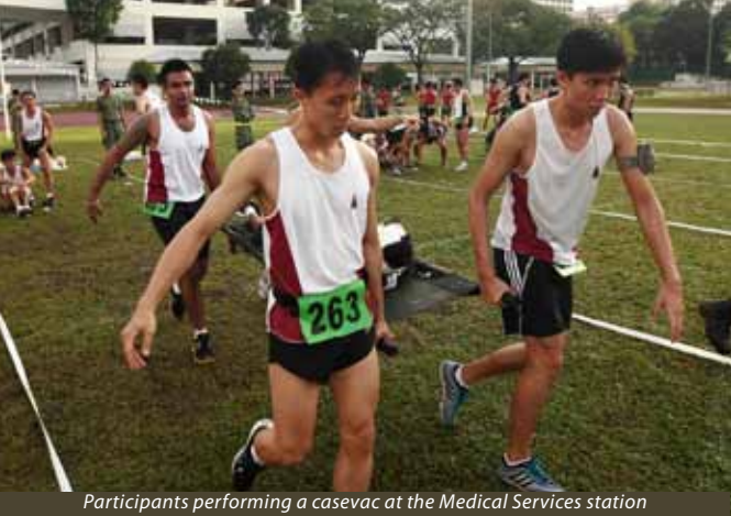
Participants performing a casevac at the Medical Services station