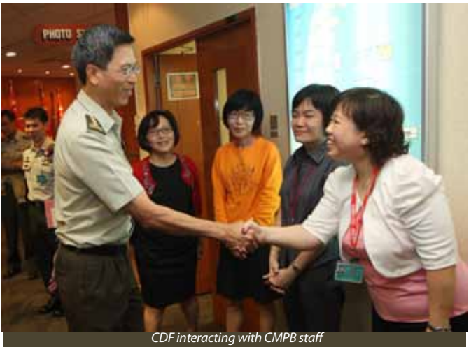
CDF interacting with CMPB staff