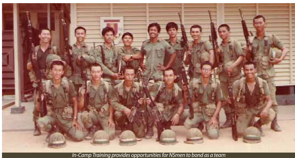
In-Camp Training provides opportunities for NSmen to bond as a team

After AOH, the showcase will travel to selected heartland malls during the June school holidays. It will make a stop at the Employers' Support for Total Defence Symposium before the stories are eventually archived as part of the Singapore Memory Project.