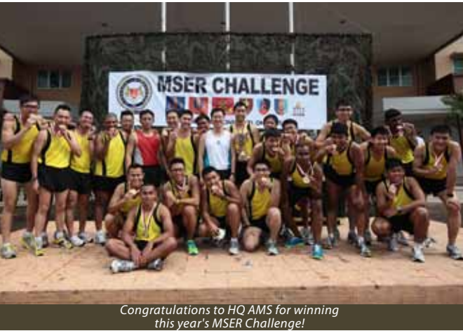
Congratulations to HQ AMS for winning this year’s MSER Challenge!