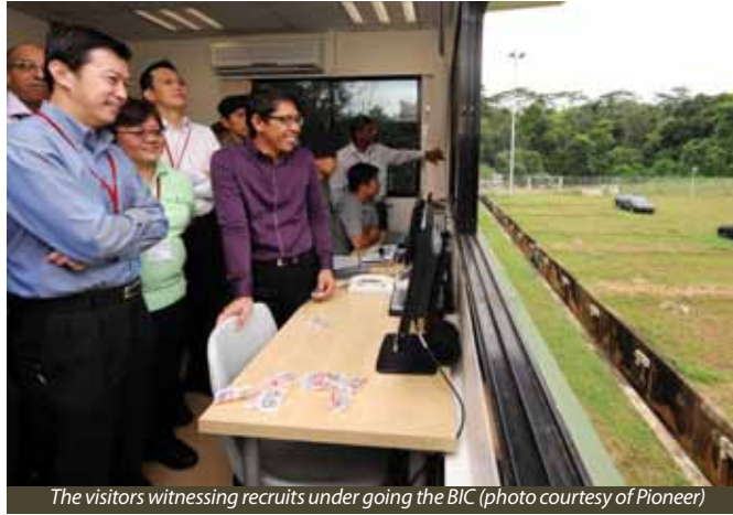
The visitors witnessing recruits under going the BIC