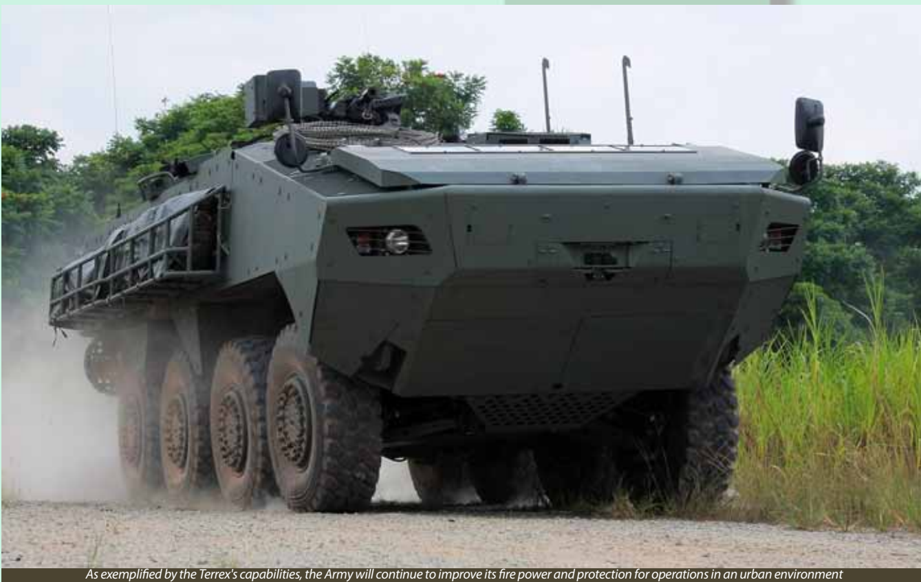
As exemplified by the Terrex's capabilities, the Army will continue to improve its fire power and protection for operations in an urban environment

To better equip our ground leaders, we have also enhanced systematic training, education and grooming, introducing Leadership and Organisation Development training to key commanders in Training Institutes and the well-received Army Warrant Officer Leadership Development Programme.