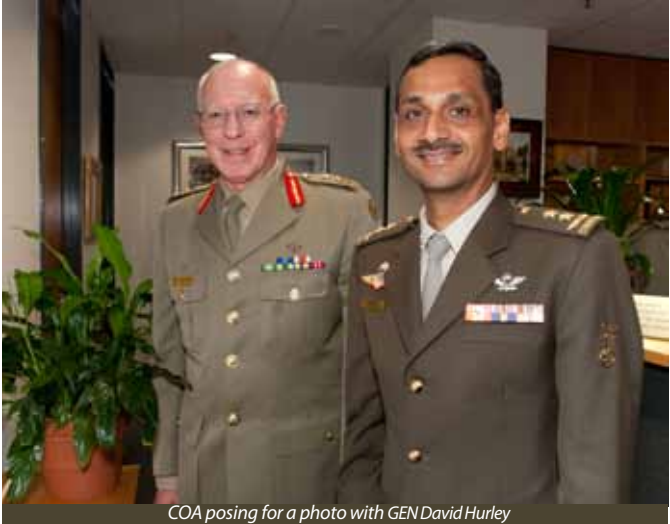
COA posing for a photo with GEN David Hurley

The visit highlighted the close ties between the Singapore and Australian armies.