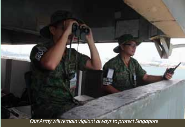
Our Army will remain vigilant always to protect Singapore

To explore innovative solutions for overcoming the complexity and challenges in urban operations, the Army Urban Operations Challenge will be organised this year with the intent to draw out new ideas and concepts. Participating units will be given free play to configure their fighting forces to achieve mission success and derive new concepts for the Army.