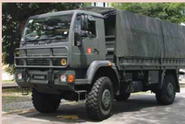
The current MAN five-tonner boasts a number of advanced features to make it safer and better