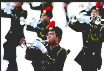
The Tanjong Katong Secondary School Band provides the fanfare