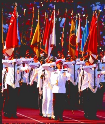
The Colours Party preparing for the March Past