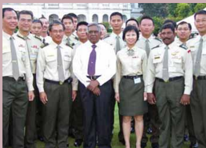
President S R Nathan and some of the SAF officers at the Garden Reception

The 9th Presidential Garden Reception was organised by the Signals Formation on 11 July at the Istana lawn. Hosted by His Excellency, President S R Nathan, the annual event accords recognition to active servicemen, Operationally-Ready National Servicemen as well as personnel from MINDEF and Defence Science and Technology Agency for their contributions to the defence of Singapore. 🇸🇬