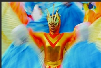
Preparing to soar