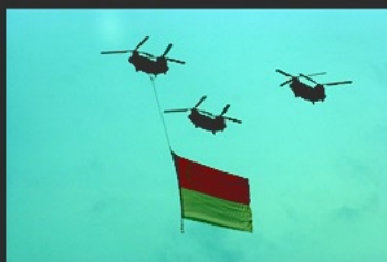
Helicopters flying Singapore's flag past the stadium