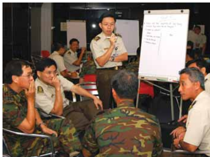
Participants brainstorming for ideas on how to enhance the Army experience

Our Army has a strong culture. This, together with various other factors, directly influences the experience of every soldier who goes through National Service.