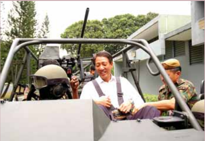
Minister for Defence, RADM (NS) Teo Chee Hean taking a ride on the Light Strike Vehicle

Minister for Defence, RADM (NS) Teo Chee Hean visited HQ Guards on 27 July. Speaking to the Guardsmen, RADM (NS) Teo said, "The work that you do here is very useful for the Army and SAF. We appreciate the dedication and commitment that you have shown."