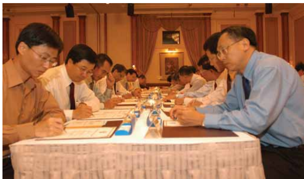
Reaffirming their support for Total Defence, employers and civil resource owners signed the Declaration of Support Certificates

On 23 July, 102 employers, 65 civil resource owners and 12 Operationally-Ready National Servicemen (NSmen) received awards in recognition of their contributions and support to Total Defence. Minister for Defence, RADM (NS) Teo Chee Hean was the Guest-of-Honour at the award presentation ceremony held at Orchard Hotel.