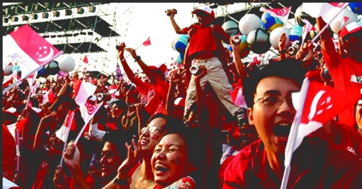
The crowd cheers for Singapore's 39th birthday