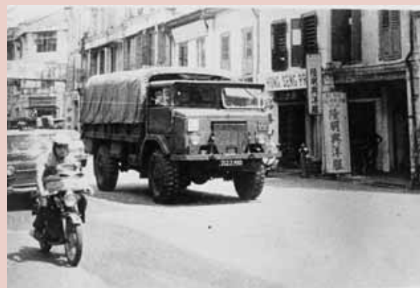
The two-and-a-half tonners used in the 1960s were shaky and gave many maintenance problems

The SAF further purchased Bedford three-tonne trucks in 1971 from the British Army as well as Australia, and Mercedes Benz three-tonne trucks in 1972. These vehicles served our defence force faithfully for over 20 years before they were phased out.