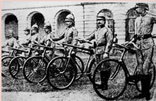
The very first military transport unit was made up of a section of cyclists

The first-ever military transport unit in Singapore was formed in 1898 with the establishment of the Singapore Volunteer Artillery Cyclist Section. This section of cyclists strove to meet the transport needs of the service corps and was the forerunner of the modern transport set-up in the SAF.