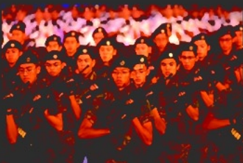
Military precision on display