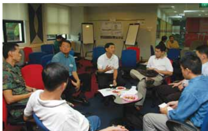
HR and non-HR personnel engaged in active discussion to share their thoughts and perspectives on Army HR matters

On 16 July, the Army Human Resource (HR) Workshop was held at the SAF Warrant Officers'