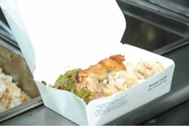
The new meal boxes are made out of recycled paper, enabling us to save more trees

Our soldiers now no longer have their outfield meals packed in squat styrofoam boxes in styrofoam containers. HQ Supply & Transport (HQ S&T) has introduced new paper meal boxes and meal box carrier bags, with all camps SAF-wide now using the new items.