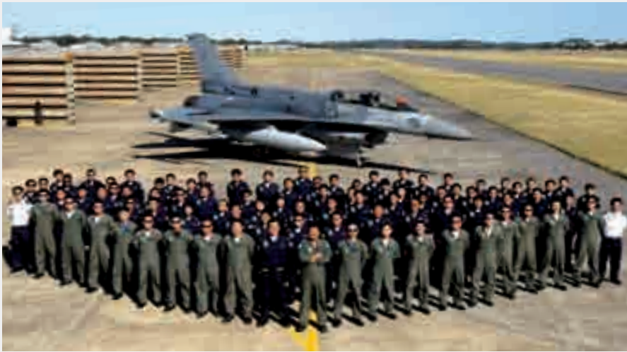
The inaugural F-16D Blk 52+ detachment to Williamtown Air Base.

More than 90 personnel from 145 SQN participated in an exercise at the Royal Australian Air Force (RAAF) Williamtown Air Base with six F-16D Blk 52+ fighter aircraft. The exercise, held from 11 Sep – 16 Oct 07, marked the RSAF's first F-16 detachment to Williamtown Air Base.