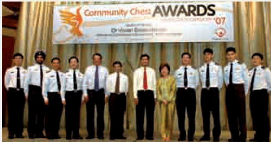
RSAF recipients of the SHARE Awards at the Raffles City Convention Centre.

The annual Community Chest Awards ceremonies are held to acknowledge and show appreciation to corporations, community organisations, foundations and groups that give generously to the less fortunate in our community. This year, a total of 34 RSAF units were awarded the Social Help and Assistance Raised by Employees