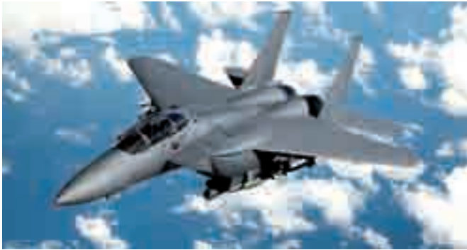
The F-15SG is the latest and most advanced variant of the USAF F-15 fighter aircraft.

In Dec 05, MINDEF announced the purchase of an initial 12 Boeing F-15SG fighter aircraft to replace the RSAF's ageing A-4 Skyhawk fighters. MINDEF has, on 22 Oct 07, exercised the option to purchase eight more F-15SG fighters which was part of the original contract signed in Dec 05. Along with this buy, an additional order for four F-15SGs was made.