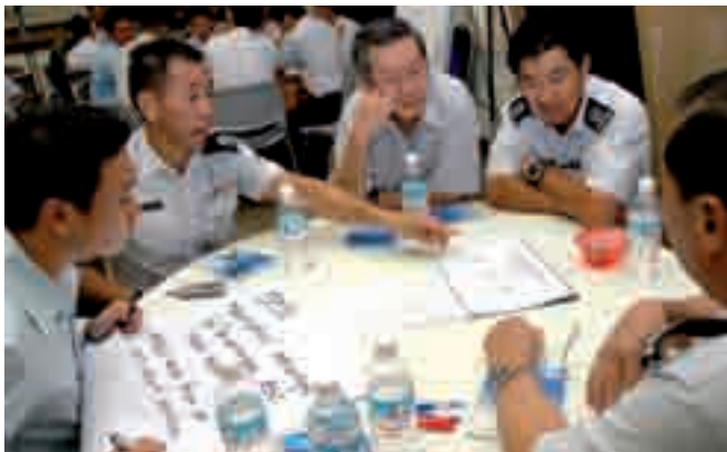
Groups gathered in a café-style format to engage in lively discussions to tackle various safety-related problems.

The CAF Safety Forum, organised by the Air Force Inspectorate, was conducted at Changi Air Base Auditorium on 7 Nov 07. Apart from promoting awareness and educating servicemen on safety matters, the Safety Forum also provided updates on recent developments in aviation safety issues within the RSAF. During the session, participants also engaged one another in discussions on the topics of 'Safety Fundamentals and Training' and 'Operations Fundamentals and Training'. As with previous CAF Safety Forums, the discussions were held café-style, which promoted uninhibited discussions and new ideas.