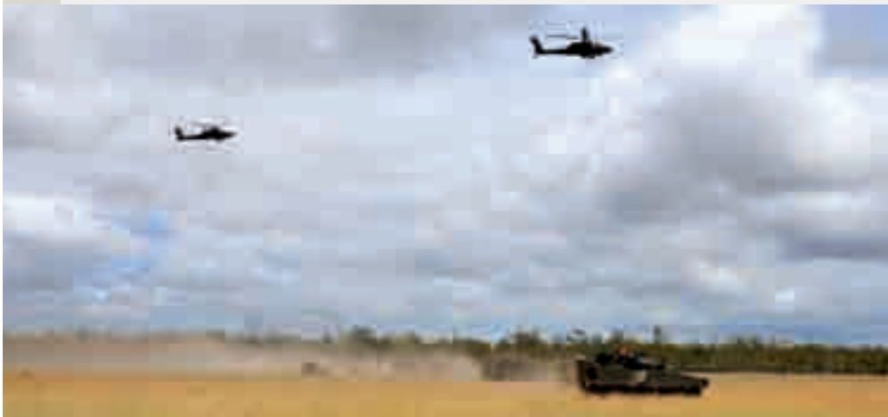
The RSAF's Apaches buffer the Army's advancing armoured column, adding to its lethality.

To validate and strengthen the Air-Land integration as a 3 rd Generation fighting force, the RSAF and the Army participated in Exercise Wallaby 07 at Shoalwater Bay Training Area, Rockhampton, Australia. Over 480 RSAF personnel from various units and squadrons were involved in the exercise, held from 1 Oct to 1 Dec 07. The RSAF also deployed various aircraft, including the AH-64D Apache Longbow attack helicopters, Super Puma helicopters, C-130 transport aircraft and Searcher Unmanned Aerial Vehicles (UAVs). Air Defence systems, such as the Agile Multiple Beam Radar and Mechanised Igla, were also deployed during the exercise.