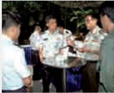
CDF visited PLAB and interacted with personnel from stand-by units through a breakfast session.

On 31 Dec 07, CDF, LG Desmond Kuek, visited stand-by units at Paya Lebar Air Base (PLAB). During the visit, CDF interacted with pilots, logisticians, field defence and other Base personnel over a breakfast session. CDF also reiterated the importance of stand-by duties to Singapore's security and reminded personnel that their efforts were well recognised.