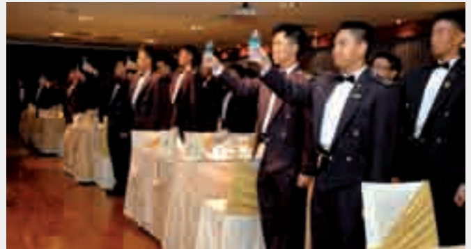
Celebrations for the graduands concluded at the RSAF Graduation Dining-In.