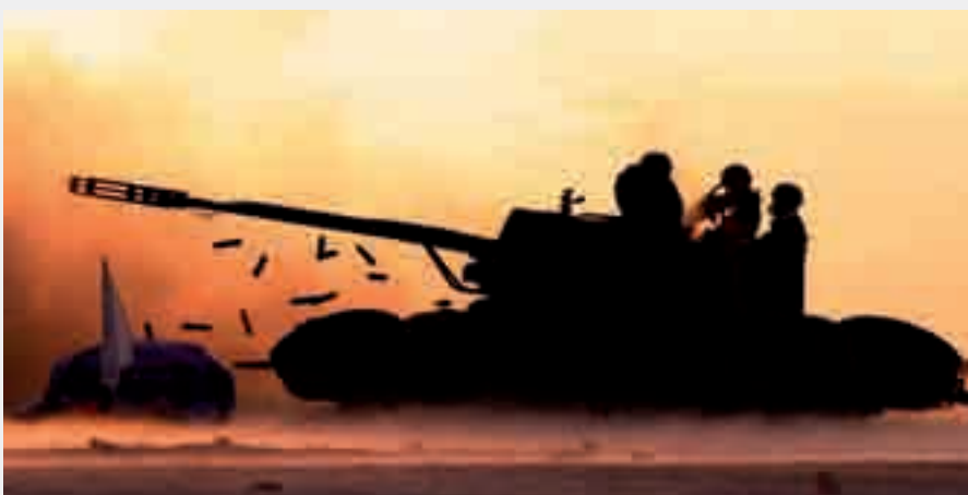
The Live Firing Exercise provided personnel from 160 SQN invaluable experience in operating the 35mm Oerlikon Anti-Aircraft Guns.

Nearly 200 personnel from the RSAF participated in a Live Firing Exercise, held at Woomera, Southern Australia, from 26 Sep – 13 Oct 07. Conducted by 160 SQN, the Live Firing Exercise gave both operators and commanders a realistic experience of operating the 35mm Oerlikon Anti-Aircraft Guns and further strengthened their operational readiness.