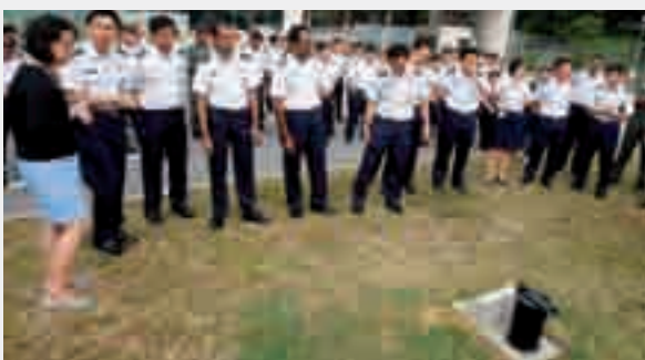
Celebrations for CAB's 36 th Anniversary included the sealing of a Heritage Capsule.

Changi Air Base (CAB) celebrated its 36 th Anniversary with a series of cohesion activities including inter-unit bowling, soccer and singing competitions, a 'Family-at-Work Day' and a treasure hunt from 30 Nov – 4 Dec 07.