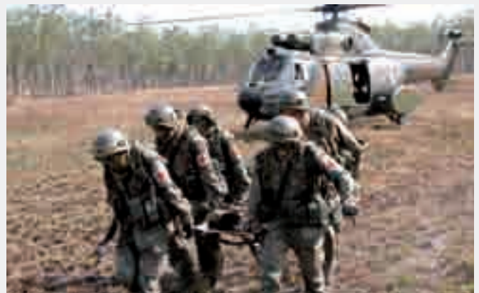
Super Pumas providing swift evacuation for wounded troops. Doctors and medics are present on board the Super Puma to deliver immediate medical attention.