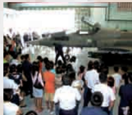
Family members had the opportunity to view PLAB personnel conducting daily operations such as the maintenance of the F-5 fighter aircraft..

The half-day event concluded with a Christmas Gala at the PLAB WOSA Mess. Base personnel enjoyed a movie screening over a sumptuous dinner, while children in particular were entertained at the computer gaming section.