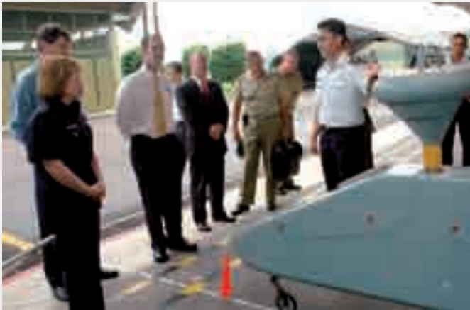
As part of JASINCG, the Australian delegation viewed UC's Searcher UAVs.