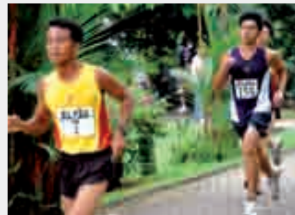
Participants completing the 4.8km Cross-country run.

addition, it promotes the development of sportsmanship, team spirit and unit cohesion within the SAF.