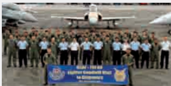
TNI AU and RSAF participants of the Fighter Goodwill Visit at PLAB.

Following the Indonesian Air Force (TNI AU) – RSAF Fighter Goodwill Visit to Hasanuddin Air Force Base, Indonesia, from 23 – 26 Jul 07, 83 TNI AU personnel conducted a reciprocal visit to the RSAF from 26 – 28 Dec 07. A Professional Exchange Session was hosted at Paya Lebar Air Base (PLAB), where TNI AU personnel were briefed on the history of the RSAF and ongoing transformation of the RSAF into a 3 rd Generation Air Force. This was followed by a visit to the Flight Simulator Centre, where they were shown the F-16 and F-5 Operational Flight Trainer.