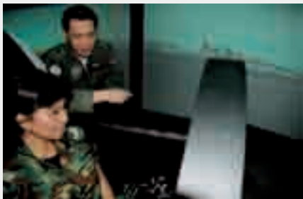
An NCC Cadet Trainee being shown the capabilities of the RSAF's latest Air Mission Trainer.