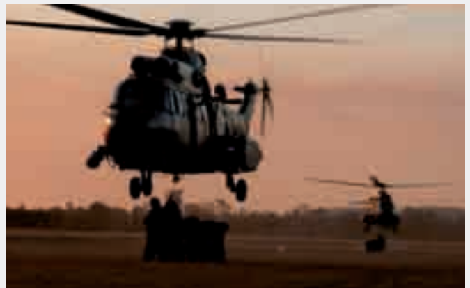
The RSAF Super Pumas delivering supplies to troops on the battlefield.