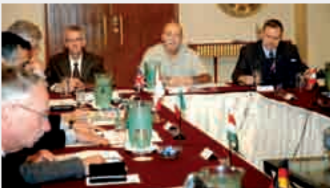
BG Blondin (2 nd from right) headed the 19 th NFTC Steering Committee meeting.

The RSAF welcomed 32 delegates from 10 countries for the 19 th NATO Flying Training in Canada (NFTC) Steering Committee meeting, held in Singapore from 3 – 7 Dec 07. The delegation, headed by BG Yvan Blondin of the Royal Canadian Air Force, was hosted by Head Air Training, LTC Leong Kum Wah.