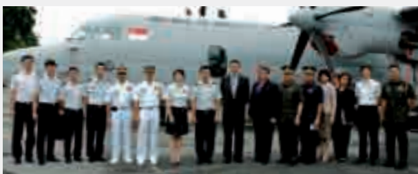
Mr Teodoro Junior (8 th from right) and the Philippines delegation viewed the Fokker 50 static display at 121 SQN during their visit.