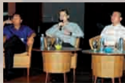
Senior commanders addressed concerns raised by the ADSS community during the dialogue session.