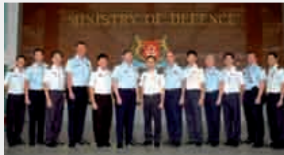
Air Working Group participants from the RAAF and RSAF.

The meeting reinforced the long-standing defence relations and close working ties between the RAAF and RSAF. Both air forces interact regularly through professional exchanges and exercises.