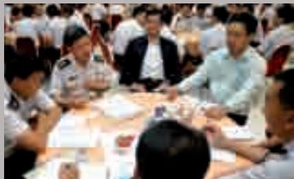
Participants from across the RSAF shared ideas on propagating Project CARDINAL and expressed their views through café-style discussions and open dialogue sessions.