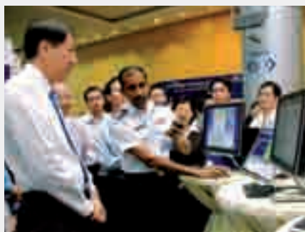
Minister for Defence, Mr Teo Chee Hean, viewing the Enterprise System.

The Defence Technology Prize (DTP), established in 1989, recognises the contributions of members of the defence technology community in enhancing Singapore's defence and national security. Considered MINDEF's most prestigious award, the DTP, conferred annually, serves to spur more than 5,000 scientists and researchers to make breakthroughs in defence science and technology.