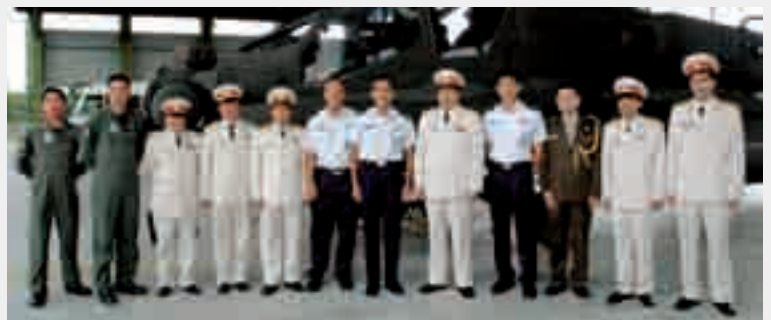
Minister of National Defence, Socialist Republic of Vietnam, Mr Thanh (5 th from right), and his delegation visited PC, where they were hosted by COMD PC, BG Wong (6 th from right).

Minister Thanh's visit underscores the warm defence relations between Singapore and Vietnam.