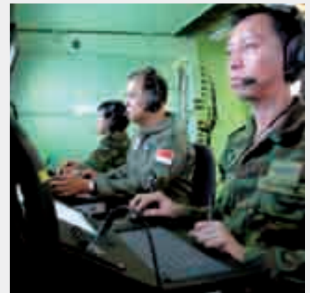
Real-time airspace management provides commanders greater situational awareness to make better-informed decisions.

Besides the ability to carry out precision strikes, the Sensor-Shooter network also