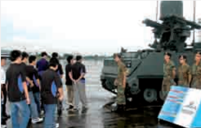
Year Two JC students viewed RSAF weapon systems such as the Mechanised Igla.

62 Year Two Junior College (JC) students and 52 Year One JC students visited the RSAF on 5 and 6 Dec 07 respectively. The visits were part of the annual MINDEF Internship Programme, which engages potential SAF Overseas and SAF Merit scholars and provides them with a better understanding of the roles and daily operations of the SAF.