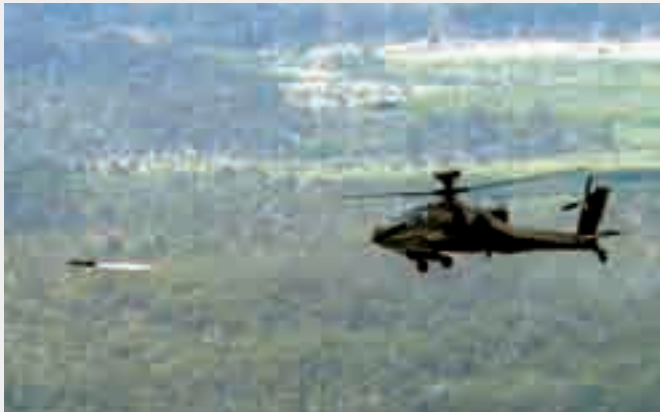
The Apache Longbow attack helicopter provides the land campaign greater firepower, especially against enemy armoured columns