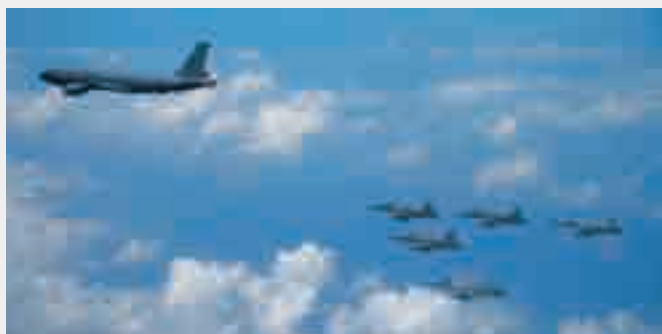
2007 marked the inaugural RSAF F-5 participation in Exercise SINDEK in India.

The RSAF and the Indian Air Force (IAF) participated in Exercise SINDEK 07 from 26 Nov – 13 Dec 07 at the Kalaikunda Air Force Station, East India. This year's bilateral exercise saw the participation of six F-5 fighter aircraft, two RBS-70 Fire Units (FUs), a Mistral FU and a Portable Search and Target Acquisition Radar. A total of 131 RSAF personnel were involved. Together with the IAF's MiG-27 ground attack fighter aircraft, the RSAF conducted various air-to-air and air-to-ground training.