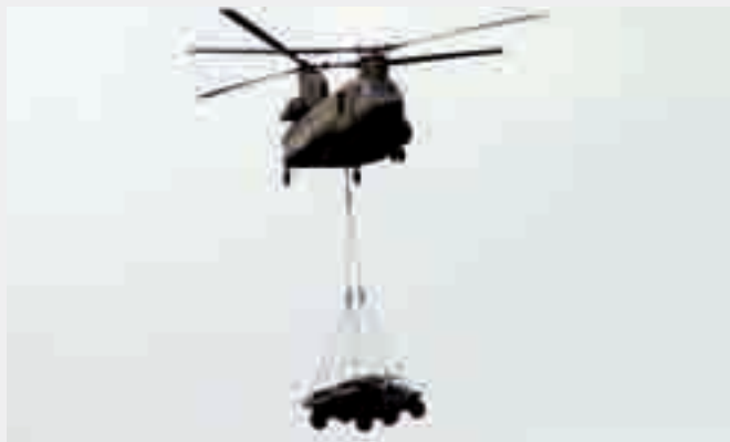
Chinooks will continue to provide air mobility to troops, weapon systems and supplies under PC's HeliG.

Apart from its peacetime roles, PC will also be the main driver for the RSAF's integration with the Army and Navy to deliver the full range of airpower, including the RSAF's fighter, transport, UAV, helicopter and air defence capabilities, to achieve the Army's and Navy's operational missions.