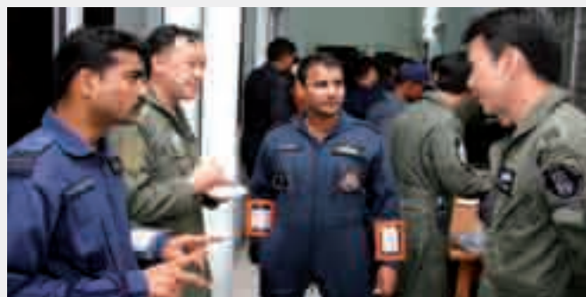
RSAF and IAF personnel had plenty of opportunities to interact and to learn from one another.