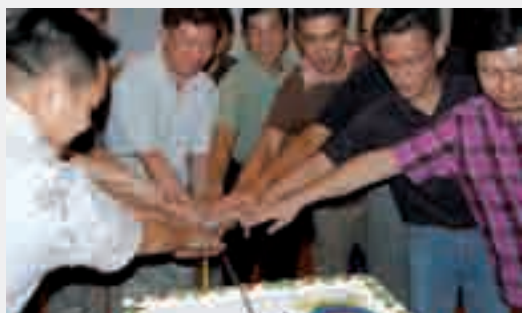
COMD AFS (2 nd from left) and senior AFS officers cutting the traditional AFS 7 th Anniversary cake.

The Air Force School (AFS) 7 th Anniversary celebrations was held at AFS on 29 Dec 07. All AFS personnel, trainees, and their family members were invited to the event.