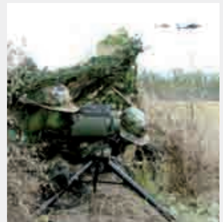
Among the integrated operations tested at Exercise Wallaby was the laser-guided precision strike, conducted between the commandos and the Apaches.