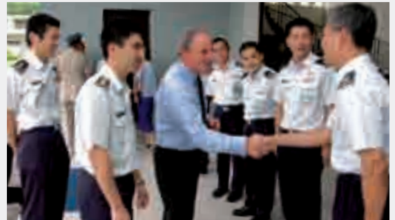
ACM(Ret) Sir Peter Squire meeting Principal Staff Officers at TAB.

ACM(Ret) Sir Squire's visit reflects the warm and long-standing defence relations between UK and Singapore.