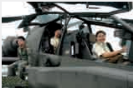
NCC Teacher Officers got up close with the AH-64D Apache static display.