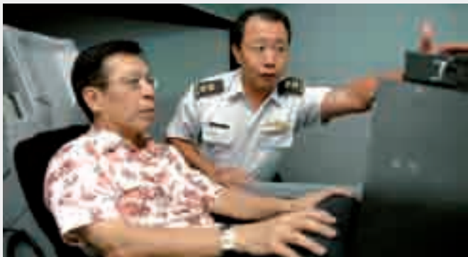
Minister for National Development, Mr Mah Bow Tan, learning more about the RSAF's latest Air Mission Trainer.

Members of the Pyramid Club visited Paya Lebar Air Base (PLAB) on 24 Nov 07, hosted by Minister of State for Defence, Associate Professor Koo Tsai Kee.