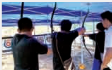
Activities such as archery (above) and air rifle shootouts as well as bowling kept Base personnel entertained.

Paya Lebar Airbase (PLAB) celebrated its 26 th Anniversary at Yishun SAFRA on 26 Oct 07. It was a half-day free-and-easy event for the Base personnel to enjoy themselves in a relaxed setting. There were indoor and outdoor activities catered for everyone. The celebration concluded with a sumptuous lunch and a lucky draw.