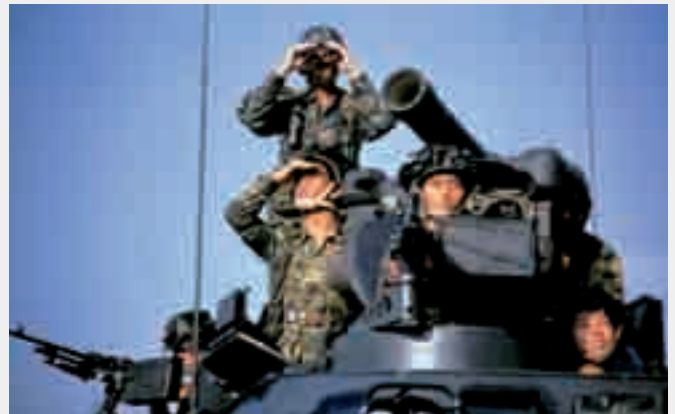
The RBS-70 providing protective anti-air capabilities to the land campaign.

The inauguration of PC is a milestone not only for the 3 rd Generation RSAF, but also the ONE SAF. Though a new Command, the re-organisation has already yielded substantial results, and PC will continue to develop air participation for the 3 rd Generation SAF campaign.