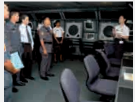
RBAirF Warrant Officers learning more about training facilities at the AFS.

The RSAF – RBAirF Warrant Officer Exchange Programme is one of several professional exchanges between the RSAF and the RBAirF, and is reflective