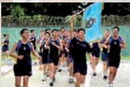
ADOC personnel bonded during the festive season through the ADOC Cohesion Run.

insight into the issues and concerns of their men, while the ADSS community left with a clearer understanding of management directions and policies.