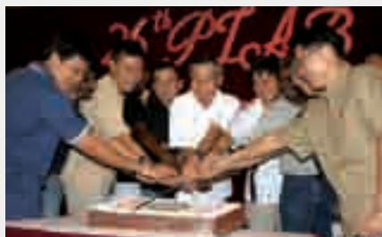
PLAB celebrated its 26 th Anniversary with a traditional cake-cutting ceremony.