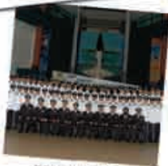
RCGC and RCDI