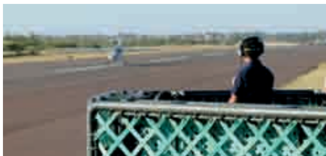
The Searcher UAVs provided real-time images to enhance the Sensor-Shooter network for faster response.

Exercise Lightning Warrior also marked the first time our AH-64D Apache Longbow helicopters were deployed to South Africa. The helicopters provided the air power to carry