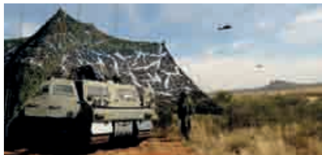
EX Lightning Warrior saw the STORM team and the Apaches helicopters carrying out integrated operations to enhance the Sensor-Shooter network.