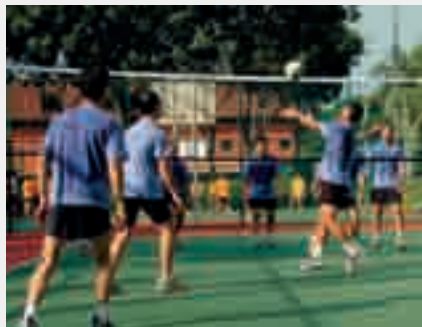
The RSAF's team playing volleyball, a game which they obtained the top score.