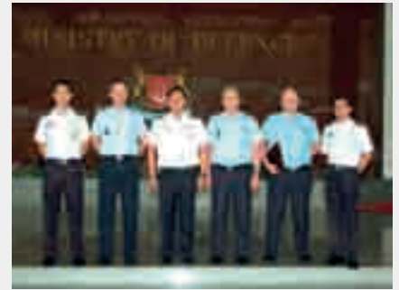
The GAF delegation and their RSAF hosts posing for a memento photo.

The visit allowed the RSAF and GAF to gain a better understanding of each other's operations and build closer relations between the two air forces.