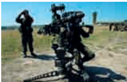
Mistral Fire Unit acquiring a thermal lock-on during the exercise.