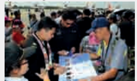
The Thai locals also had an opportunity to get up close and personal with the Black Knights team.