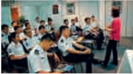
Participants learnt new skills which will enable them to contribute more effectively to the RSAF.

On 26 Jun 08, Air Power Generation Command – Paya Lebar Air Base (APGC – PLAB) organised a Learning Day at Paya Lebar Air Base. The event provided an opportunity for participants to learn new skills to enable them to contribute more effectively to the RSAF while at the same time equipping the supervisors of APGC with the requisite CARDINAL tools-of-the-trade to enable them to