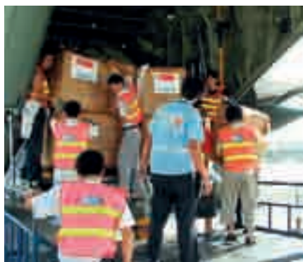
Unloading medical supplies, food and other relief supplies, for the victims of Cyclone Nargis, from the C-130 Hercules transport aircraft.

On 2 May 08, Myanmar was struck by Cyclone Nargis. Days later, on 12 May 08, China was hit by an earthquake which measured 7.9 on the Richter scale. The two natural disasters resulted in the loss of tens of thousands of lives with many more injured or displaced from their homes.