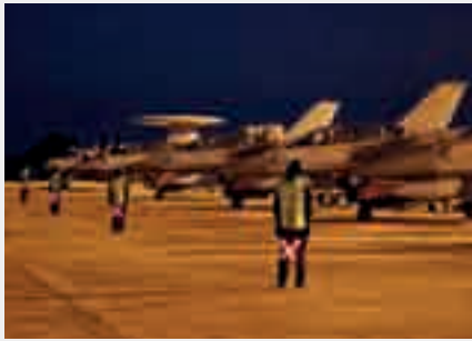
F-16D Blk 52+ Fighting Falcons from 145 SQN preparing to depart for a night sortie.

The RSAF participated in the biennial large-scale multilateral air combat exercise, codenamed 'Exercise Pitch Black', held in Darwin, Australia, from 6 to 27 Jun 08. This year's Exercise Pitch Black is the largest to be held since it first started in 1990, with about 3000 participants from the Royal Australian Air Force (RAAF), Royal Thai Air Force (RTAF), United States Forces, French Air Force (FAF), Royal Malaysian Air Force (RMAF) and the North Atlantic Treaty Organisation (NATO).