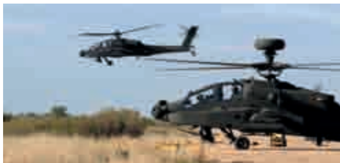
AH-64D Apaches helicopters from 120 SQN took part in Exercise Lightning Warrior for the first time.

The RSAF and the Army participated in Exercise Lightning Warrior 08 at Lohatla Combat Training Centre, South Africa, from 10 – 27 May 08. The unilateral exercise was held to provide a platform for Air-Land integrated operations so as to strengthen and validate the vertical integration from the Division Headquarters to the sensors and shooters in the field. The RSAF deployed a total of 173 RSAF personnel from various units and squadrons for the exercise. In terms of assets, four AH-64D Longbow attack helicopters, four Searcher Unmanned Aerial Vehicles (UAVs) and two Portable Search and Target Acquisition Radars were deployed.