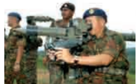
RBAirF personnel learning more about the RSAF's Mistral air defence missile system.

Since its inauguration in 1994, Exercise Air Guard has provided an excellent opportunity to enhance interoperability and the long-standing bilateral relations between the RSAF and the RBAirF. The two air forces interact regularly through bilateral exercises and professional exchanges.