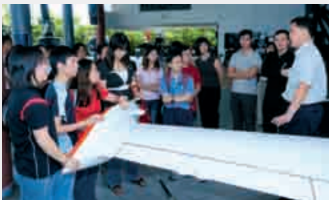
Staff from Mee Toh School toured the Air Force Museum for a better understanding of the RSAF's rich history and heritage.

On 30 May 08, 65 teaching staff from Mee Toh School visited Air Force Museum. The visit was part of the RSAF's ongoing efforts to reach out to the community and schools and to introduce them to RSAF operations, training and organisation, as well as to update them on the RSAF's transformation towards a 3 rd Generation Air Force.