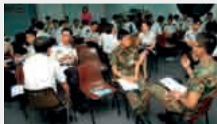
The Learning Day provided an opportunity for participants to share ideas and interact with each other.

The Air Power Generation Command – Sembawang Air Base (APGC – SBAB) Learning Day was held on 9 Jun at Sembawang Air Base and Nee Soon Camp. The event provided an opportunity for participants to be updated on the RSAF's 3 rd Generation transformation and the RSAF's and APGC's Workplan.