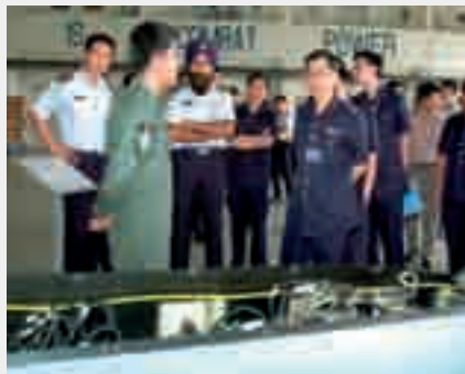
The visit allowed the delegation to learn more about the RSAF's UAVs.