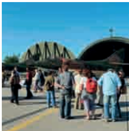
The public in France got a chance to view the RSAF's TA-4SU Super Skyhawks.

On 18 May 2008, two of RSAF's TA-4SU Super Skyhawks from 150 SQN, RSAF's fighter pilot training detachment based in Cazaux, France, participated in the 2008 Orange Air Show, held in Orange Air Base, France.