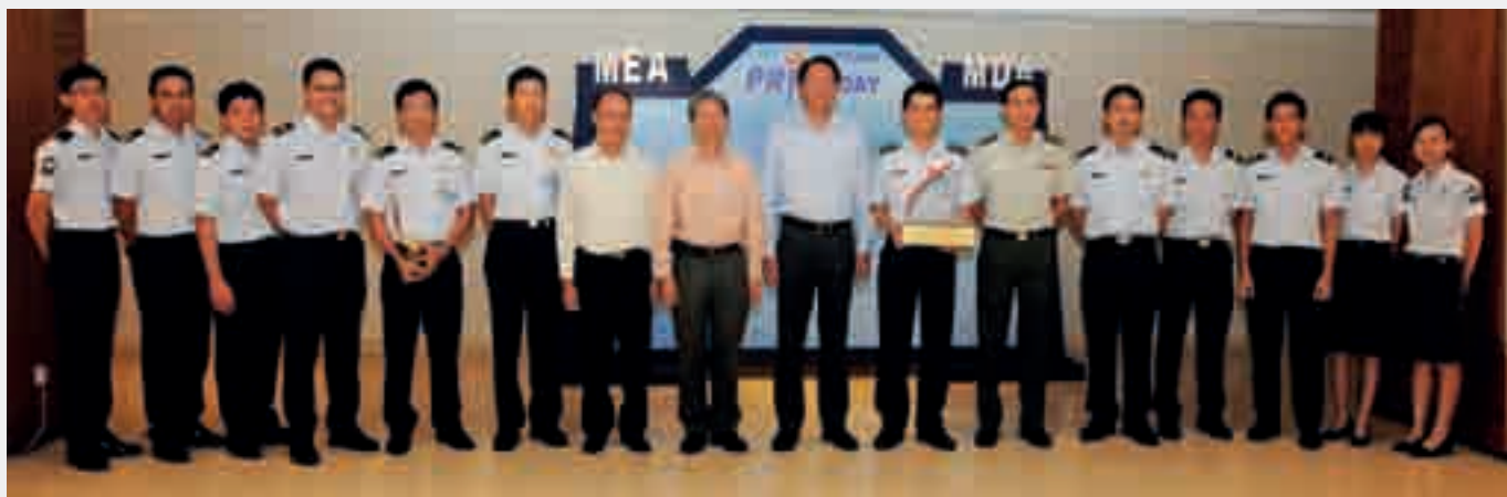
RSAF Winners for MINDEF PRIDE Day posing for a memento photo with Minister Teo, MINDEF and SAF senior officers.

Air Force News congratulates all award recipients and wishes them the best in their future endeavours and innovations!