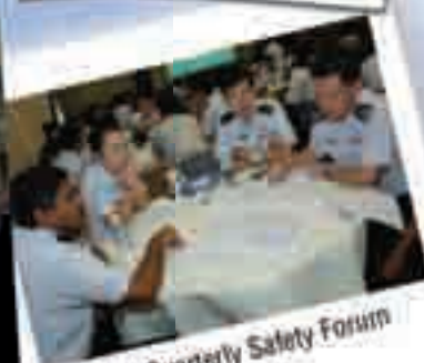
CAF Quarterly Safety Forum