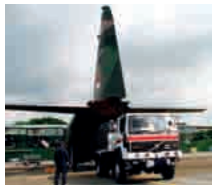
An SCDF vehicle being loaded onto one of the two C-130 aircraft at Paya Lebar Air Base, headed for Chengdu.

be able to put my training into practice to help others," said CPT Chew.