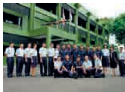
The RTAF delegation and their RSAF hosts posing for a memento photo at UC.

This exchange programme underscores the close and long-standing relations between the RTAF and the RSAF. This year marks the 25 th Anniversary of exercises between the two air forces, which interact regularly in professional exchanges, goodwill visits and exercises such as Exercise Cope Tiger.