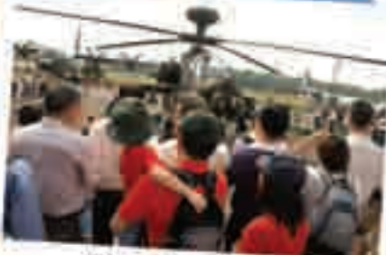
RSAF Open House