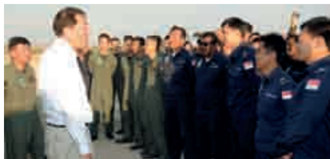
Minister Teo interacting with the RSAF personnel of Exercise Lightning Warrior 08.

Concluded Minister for Defence, Mr Teo Chee Hean, who visited the troops training at South Africa, "Nowadays, the battle moves much more quickly. The exercise confirms the SAF's capability to have comprehensive awareness and precision operations on multiple targets. This is a capability we are happy to have and reflects the effectiveness of the SAF's 3 rd Generation Transformation."