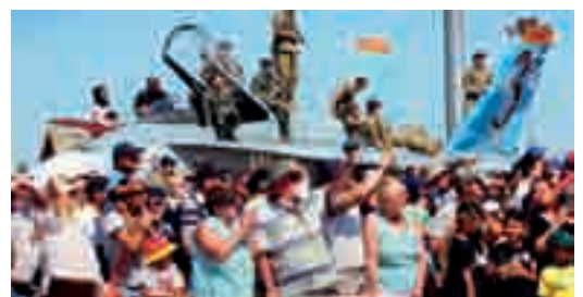
The Darwin Open Day drew large crowds to view the static display from various nations.

The RSAF and the F-16D Blk 52+ aircraft were well received by both the local community of Darwin and visitors of the other air forces at the airshow. The RSAF's presence at the airshow underscores the warm and long-standing defence relations between the RSAF and the Royal Australian Air Force.