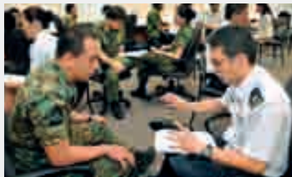
Participants of the ADOC Learning Day shared on their experiences to each other.

The Air Defence and Operations Command (ADOC) Learning Day was held at Chong Pang Camp on 4 Jul 08. The event enabled participants to better cope with changes in the cross-functional working relations within the RSAF.