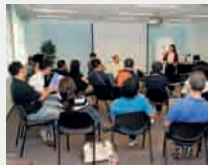
Participants from across Participation Command learnt new skills from the workshops.

involved in the event – all personnel of rank 3SG and above were invited to attend the Learning Day. This allowed many to benefit from the various workshops and presentations held. It would definitely be beneficial for more such events to be organised in the future."