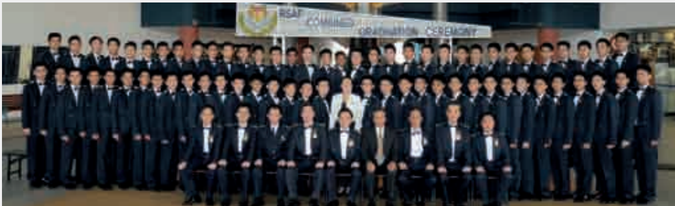
RSAF senior officers and the graduands of RCGC 02/08 posing together for a memento photo.