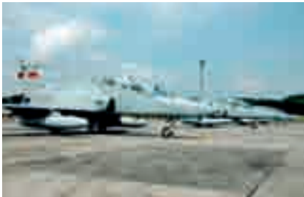
The Hawk 127 aircraft of 76 SQN, Royal Australian Air Force, at Paya Lebar Air Base.

The RSAF participated in the Five Power Defence Arrangements (FPDA) air defence exercise code-named Exercise Bersama Shield 08. As part of the FPDA and the Integrated Area Defence Systems (IADS), the exercise was jointly hosted by Malaysia and Singapore and held over the Malaysian Peninsula and the South China Sea from 4 – 16 May 08. The opening and closing ceremonies for this FPDA exercise were held at Air Force School on 5 May and 16 May 08 respectively.