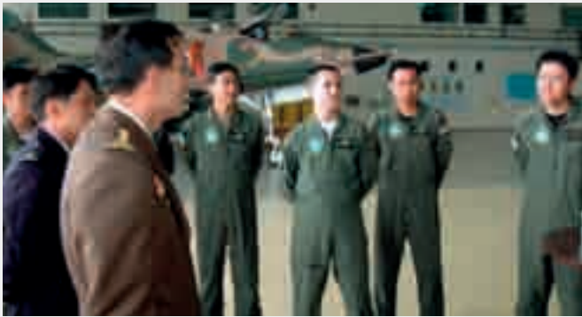
CDF, LG Kuek, interacting with 150 SQN personnel at Cazaux Air Base, France.