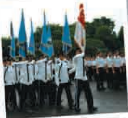
RSAF Day Parade

RSAF 40 TH ANNIVERSARY Full Spectrum. Integrated. Ready.