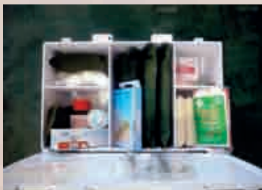
Example of a Basic Medical Kit.

Your doctor can also assist you in assembling a basic medical kit that includes medication to treat simple ailments such as colds, diarrhoea and headaches, and dressings for small cuts and abrasions. These items