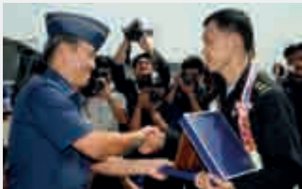
ACM Chalit presenting a token of appreciation to LTC Leng for the Black Knight's aerial display in Bangkok.

"The Black Knights are very honoured to be invited by Commander-in-Chief, ACM Chalit, for our very first overseas performance here in Bangkok. It is an honour to be performing for both the air forces, as well as for the people of Thailand,"