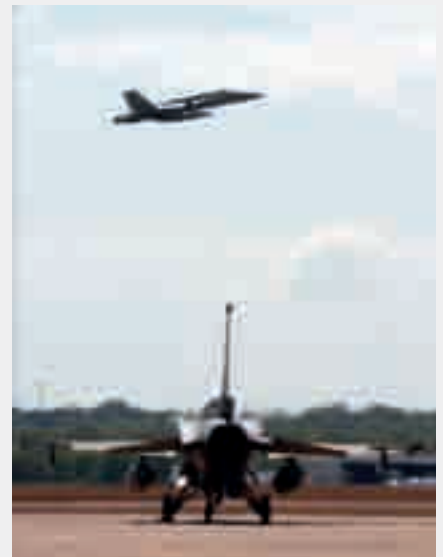
An RSAF F-16D Blk 52+ Fighting Falcon prepares for launch as an RAAF F/A-18 takes off at RAAF Base Darwin.