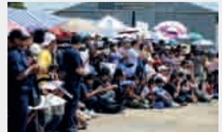
Over 10,000 locals gathered to catch the aerial display by the Black Knights.