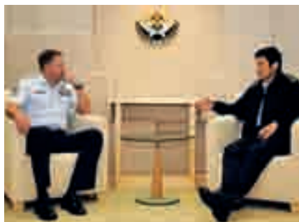
MG Ng and CMSGT Salzman engaging openly in friendly conversation.

Command Chief Master Sergeant (CMSGT), 13 th Air Force, United States Air Force (USAF), CMSGT Todd Salzman, conducted a working visit to Singapore from 5 – 7 May 08.