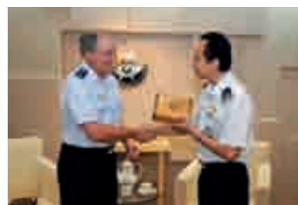
LG Utterback presenting a memento to COS (AS), BG Charles Sih.

LG Utterback's visit underscores the warm and growing defence relations between the RSAF and the USAF. Both air forces interact regularly through professional exchanges and exercises such as Exercise Pitch Black and Exercise Cope Tiger.