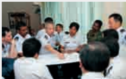
Warrant Officers from ADOC discussing ideas and views in the workshop.

Air Defence and Operations Command (ADOC) held a Warrant Officers' (WO) Air Time on 21 May 08 at the ADOC Officers' Mess. The purpose of the air time was to allow ADOC's senior management to engage and interact with the warrant officer and specialist community.