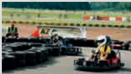
NRWCS 08 included, for the first time, a Go-Kart track where interested participants could register for a drive on the runway.

This year's NRWCS included, for the first time, a Go-Kart track where interested