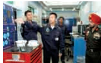
MG Lamba learning more about the implementation of integrated logistics systems in the SAF.

The visit underscores the warm and growing defence relations that India and Singapore share. The two armed forces co-operate and interact regularly in professional exchanges and exercises.