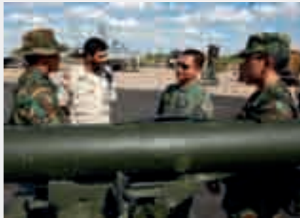
Foreign Military Observers interacting with RSAF Ground Based Air Defence (GBAD) personnel.

Moreover, the large participation by foreign air forces is a significant