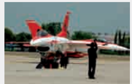
Flight line crew during the recovery of the Black Knights aircraft at Don Mueang Airport.

The Black Knights performance in Bangkok underscores the strong and long-standing relationship that has been forged over the last 25 years between the RSAF and the RTAF. Both air forces interact regular through exercises, including Exercise Cope Tiger, and other professional exchanges.