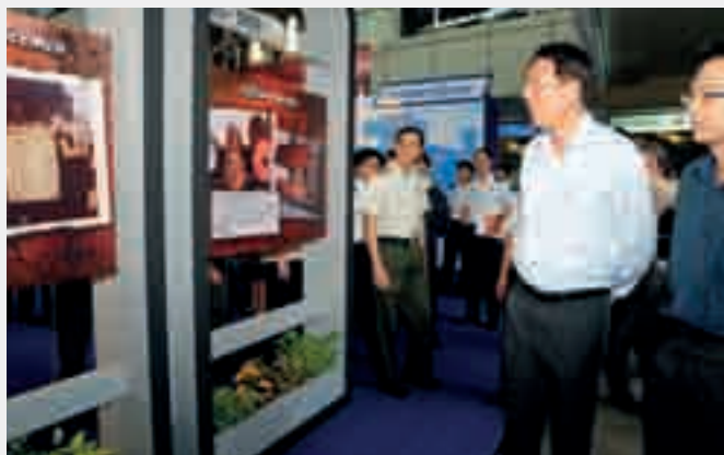
Minister Teo viewing the displays at the MINDEF PRIDE Day Exhibition at Toa Payoh HDB Hub.

The 21 st MINDEF PRoductivity and Innovation in Daily Effort (PRIDE) Day was held on 28 May 08 at the Toa Payoh Housing Development Board Hub, with the theme 'I-Action@PRIDE: Involve, Inspire, Innovate'. Besides fostering an innovative and creative mindset in our people, the theme reaffirms MINDEF/SAF's emphasis on personal involvement in the PRIDE movement. Minister for Defence, Mr Teo Chee Hean, was Guest-of-Honour for the event, which showcased and celebrated the efforts of MINDEF/SAF to improve work processes and operations.