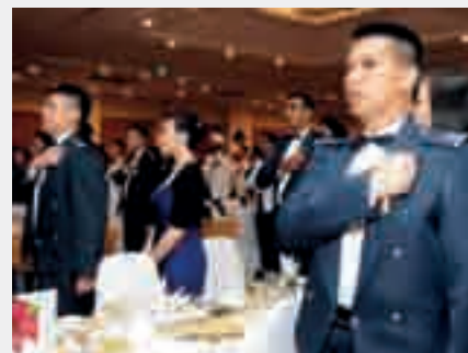
Graduands reciting the Warrant Officers' Creed.

"We learn not just about 3 rd Generation RSAF or Army or Navy, but about the ONE SAF and what we are going to