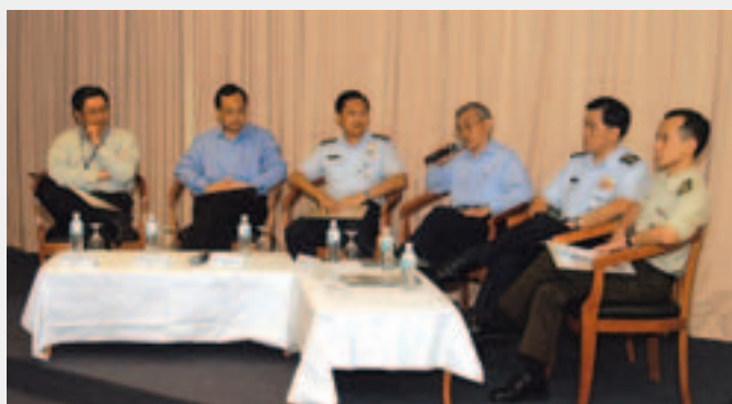
DS(A) (fourth from left), during the dialogue session at AFS.