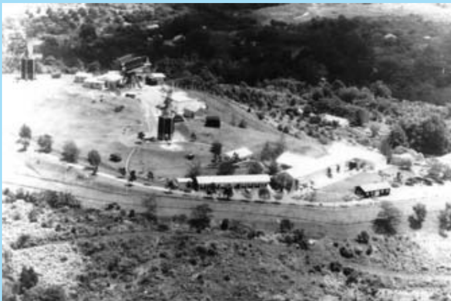
The Air Defence Radar Unit at Gombak paved the way for the formation of AFSC.

In 1995, the systematic, organisational and vocational integration that had been taking