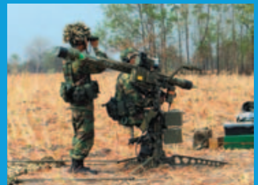
ADA systems such as the Mistral (above) were deployed in Koke Kathiem.