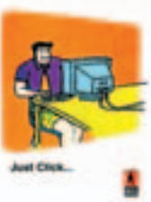
The 'Just Click' NS Initiative Booklet.

My CallUp kick started its pilot phase with PLAB and ADSD in January 2005. The rest of the RSAF formations will follow up with the launch in phases, stretching to end 2005. During the pilot phase, NSmen were given a copy of the 'Just Click' booklet, FAQs and a letter, explaining and guiding them through the various NS initiatives. This booklet was also issued to the remaining formations prior to the launch of My CallUp. NSmen simply needed