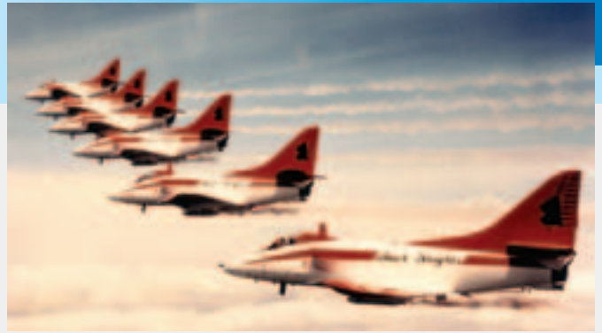
The A4-SU as the Black Knights in 1990.

While the A4-SU may have been overshadowed by the arrival of the more technologically advanced and capable F-16C/D and the F-16D Blk 52+ in the late 90s and news of its replacement by the