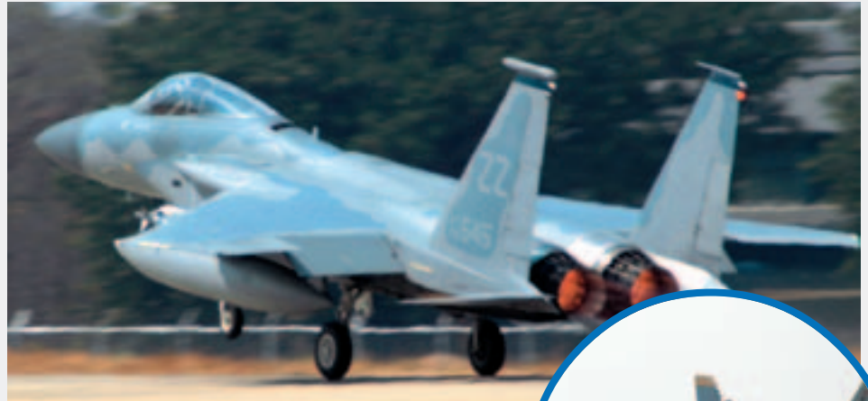
The exercise saw the deployment of numerous different aircraft from participating nations. Above: An RTAF F-15 (left) taking off. Right: A U.S. Navy F-18 taxiing for take-off.

Indeed friendship and mutual understanding between the exercise participants and the locals of Korat were the motivational factors behind the joint community relations