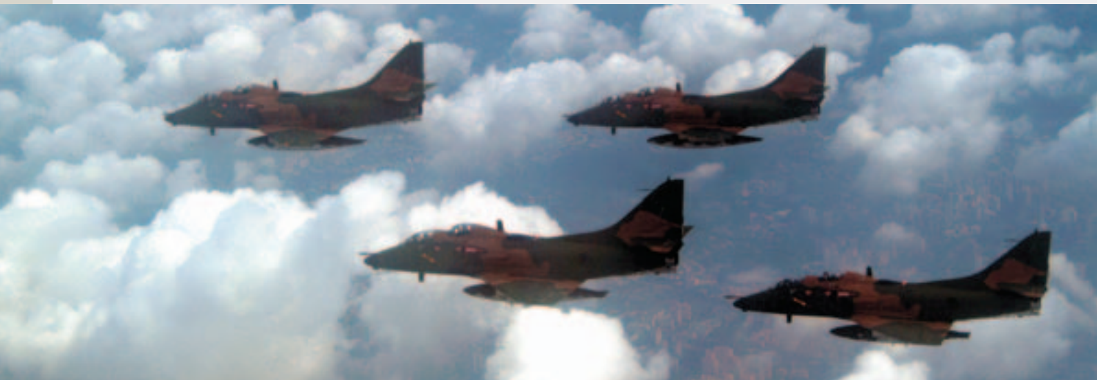
Watching over the skies of Singapore one last time: the A4-SU in flight.