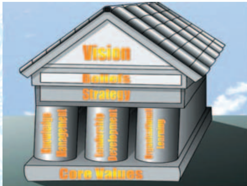
The RSAF OD framework as represented by a house imagery.

Together with the 3 key strategies of Leadership Development (LD), Organisational Learning (OL) and Knowledge Management (KM), and anchored on the RSAF's core values, the RSAF OD framework can be represented by a house imagery as shown.