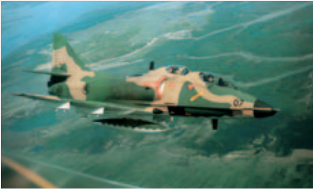
A TA4-SU training in the vast skies of Cazaux, France.

Rescued from the compactor in the United States and refurbished as the A-4S Skyhawks in 1972, the RSAF steadily increased its A-4S fleet and soon 142 SQN, 143 SQN and 145 SQN were formed to fly the A4-S. However, as engine problems threatened the reliability