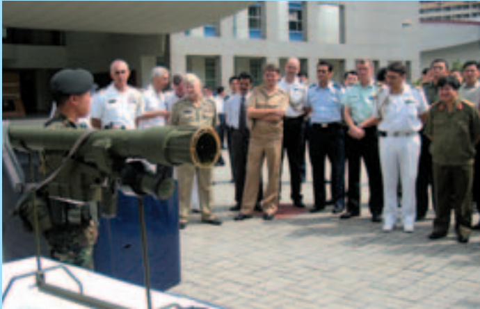
MAC members being briefed on the Igl'a's operational capabilities.