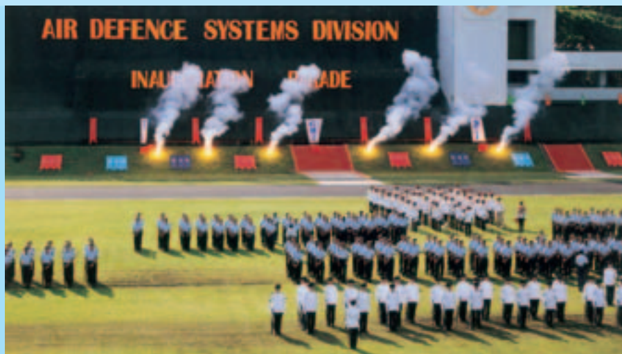
The inauguration parade of ADSD on 1 Jun 95.

place since the fusion of the Bloodhound system with the GL 161 Display and Processing system in 1972, culminated in the merger of SADA and AFSC. The result was the birth of ADSD on 1 Jun 95. The union combined SADA's ground-based air defence and AFSC's airspace surveillance specialisations, enhancing operational synergy and manpower utilisation.