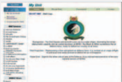
The My Unit

My Unit is a personalised unit web site residing on MIW allowing NSmen to view information such as unit events and ICT training programmes. A forum is also available for NSmen to provide feedback and stay in touch with their units.