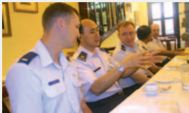
The event provided the opportunity for much discourse between officers of both air forces.

The 13 th Air Force is responsible to Pacific Air Forces to plan, execute and control aerospace operations throughout the Southwest Pacific and Indian Ocean regions.