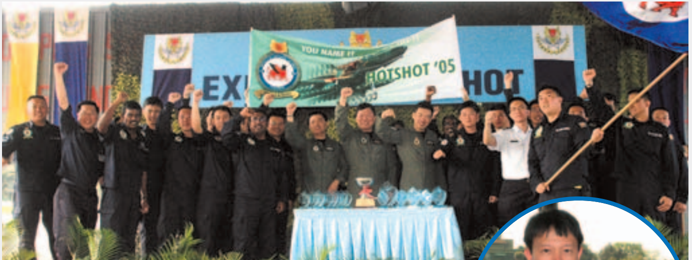
The Gryphons of 142 SQN are tops for EX Hotshot 2004/2005.

The RSAF's annual competition of pilot and logistics crew competence closed on 11 Mar 05 at Tengah Air Base. Featuring scenarios which required pilots to hit targets both on the ground and in the air, as well as testing the effectiveness of the squadrons' logistics crews, Exercise Hotshot 2004/2005 was once again a tight race between all the fighter squadrons in the RSAF.