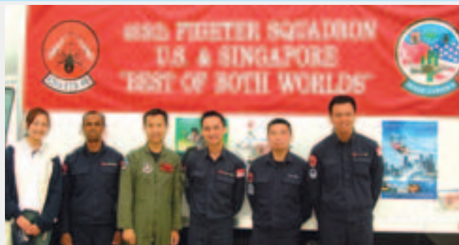
The Air Show was an excellent opportunity for PC II to showcase its unique position as a bilateral operational entity.

Through sales of squadron memorabilia and voluntary donations, the detachment managed to raise more than $4300 for its adopted charity, the Help for Kids Foundation. The sum, which is the highest the detachment has raised for the foundation, was of great significance as it went out to the less fortunate. 40 personnel from the detachment also volunteered to wrap gift baskets for Easter day on 26 Mar 05. The detachment then spent Easter day with more than 1800 less fortunate children, whose smiles brought a priceless cheer to the personnel's hearts. Without Team Excellence, none of this would be possible.