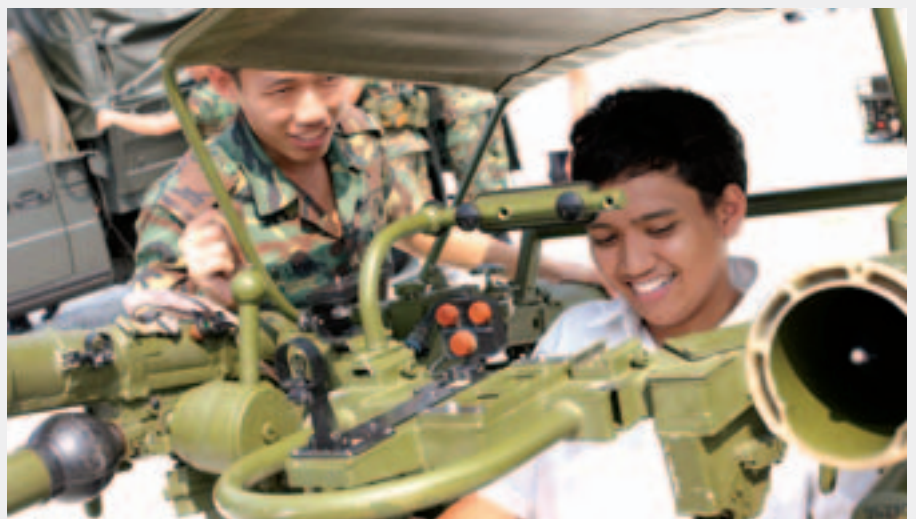
Experiencing the thrill of helming an Igla Surface-to-Air Missile system.

Adjacent to the static display was the Total Defence (TD) Zone – an area set aside to reiterate to families and guests, the need to be involved in Total Defence. Within this “Zone” were stalls where visitors could sample combat rations or have SAF standard-issue camouflage paint applied to their faces – activities which better acquainted them with the SAF “experience”. To remind visitors of Singapore’s history, video screenings on World War II and snacks such as sweet potato, which were common during the