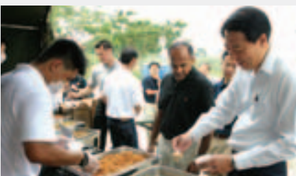
Combat Rations proved a rare delicacy for the visiting guests.

The open house followed visits by Grassroots Leaders, students from several ITEs (Institutes for Technical Education) as well as trainees from Delta Company, BMTC School 2. The visits served to familiarise guests with ADSD’s air defence capabilities.