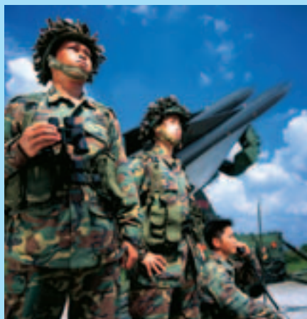
Perpetual vigilance, has and will continue to be, the mantra of the air defence community.

Our traditional constraints of strategic depth and limited air space make it necessary for ADSD to adopt a tight, multi-layered and overlapping air defence system. A network of radar detection systems provides a continuous and recognised air situation picture, while a centralised command and control system processes and analyses information from the sensors and assigns an