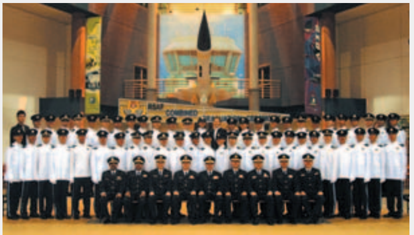
Graduands of the March ceremony together with CAF (seated, centre) and senior RSAF officers.