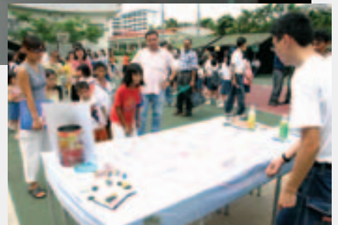
Numerous games provided young visitors with a truly fun-filled day.

The Air Defence Systems Division (ADSD) celebrated a “decade of vigilance” at the ADSD Family Day cum Open House, held on 12 Mar 05 at the ADSD Complex. The event, which kick-started ADSD’s 10 th Anniversary celebrations, saw ADSD personnel, their families, Grassroots Leaders and numerous other guests revelling in a host of activities to mark the momentous occasion. Officiating the opening of the events was Minister for Defence, Mr Teo Chee Hean.