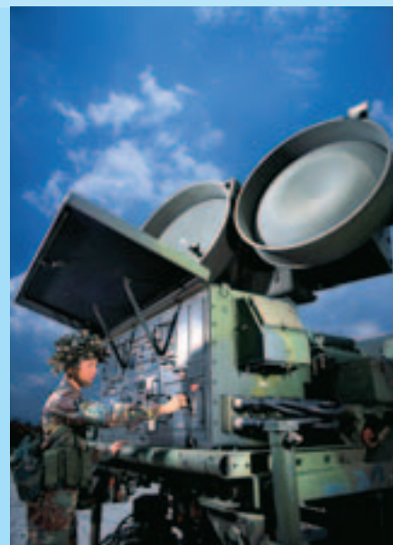
Steadfast in its duty of monitoring, scrutinising and protecting our skies.

Our traditional constraints of strategic depth and limited air space make it necessary for ADSD to adopt a tight, multi-layered and overlapping air defence system. A network of radar detection systems provides a continuous and recognised air situation picture, while a centralised command and control system processes and analyses information from the sensors and assigns an