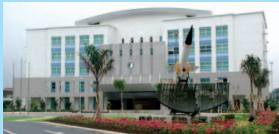
Home of the Air Defenders: The new ADSD complex at Chong Pang.

As ADSD celebrates its 10 th anniversary, it can look back with pride to its past achievements in safeguarding the sovereignty of our airspace. Celebrating "A Decade of Vigilance", the men and women of ADSD continue to pledge their dedication to keeping Singapore's skies safe and free.