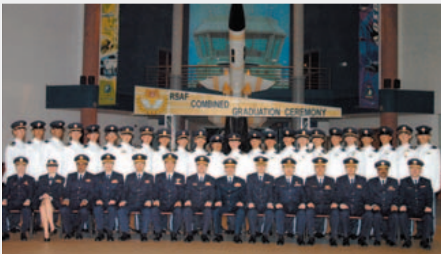
Graduands of the January ceremony together with CAF (seated, centre) and senior RSAF officers.