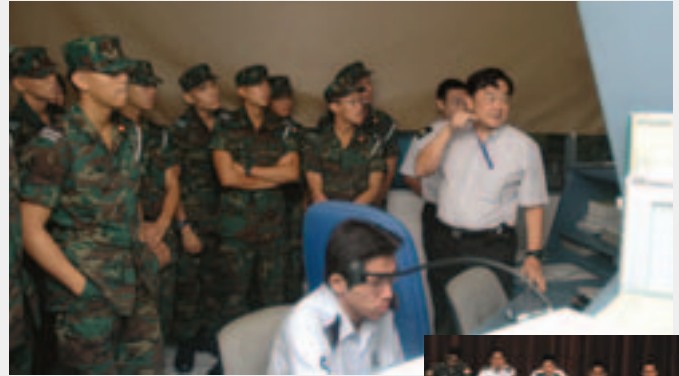
Above: Cadets being briefed on how simulator training is being carried out at Flight Simulator Centre.