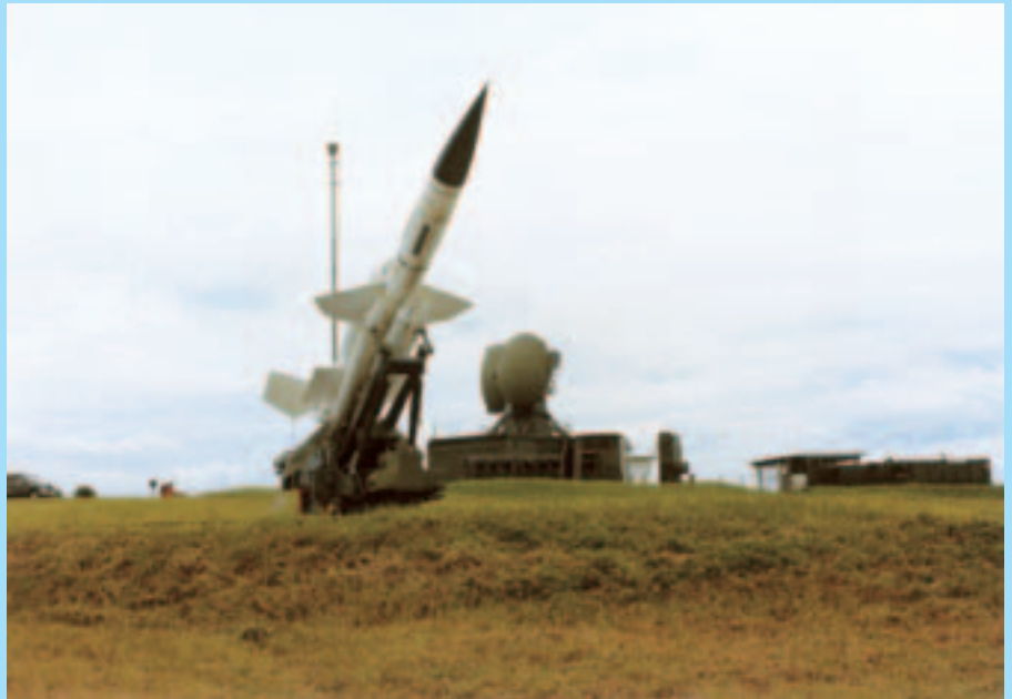
Our first air defence weapon: the Bloodhound Mark II SAM missile system.