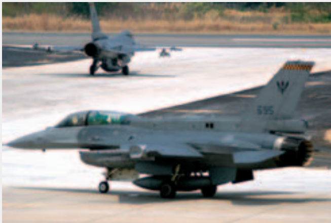
Two RSAF F-16s taxiing their new training ground in Udon.