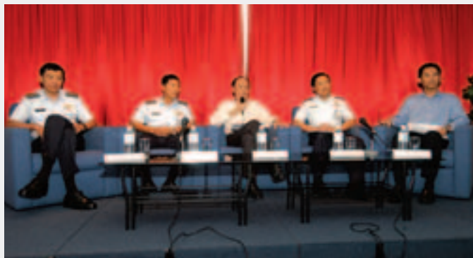
PS(DD) (centre), answering a question from the floor at SBAB.