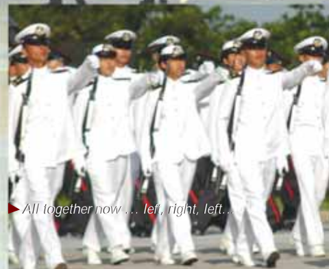
► All together now... left, right, left...