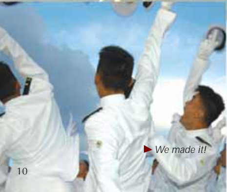
► We made it!