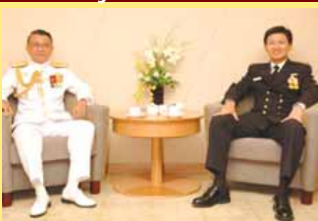
◀ ADM Chumpol Pachusanon, Commander-in-Chief, Royal Thai Navy. He was conferred Singapore's prestigious Meritorious Service Medal (Military) on Aug 5.