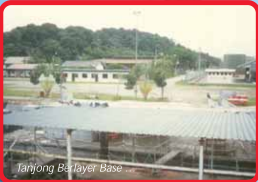
Tanjong Berlayer Base ...