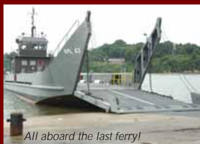
All aboard the last ferry!