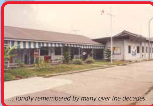
... fondly remembered by many over the decades.