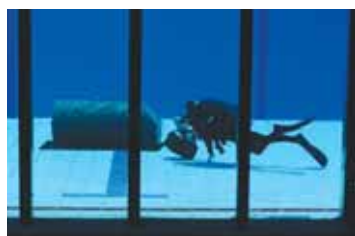
▲ Back Page: Text by MAJ Irvin Lim, Photo by Kimitsu Yogachi