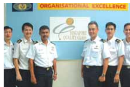
Beaming with Pride - COSCOM SQC Committee