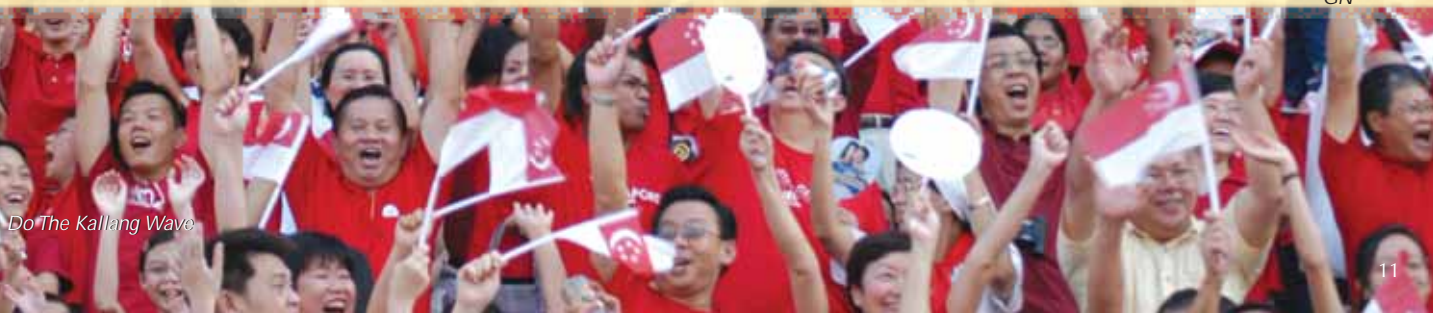
Do The Kallang Wave