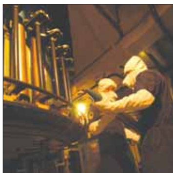
▲ Cover Photo: Picture by 3SG Gerald Neo