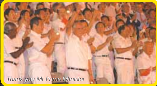
Thank you Mr Prime Minister

- Keeping a sharp lookout for our people