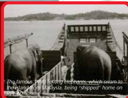
The famous 1990 Tekong elephants which swam to the island from Malaysia, being "shipped" home on RPL 60.

The Republic of Singapore Navy used to operate up to six Ramp Powered Lighters (RPLs). They were launched in pairs on 1 Jan 67, 22 May 69 and 22 Nov 85. The 1985 RPLs were then new generation craft designed to carry 500 troops or three 5-tonners, capable of speeds up to 10.5 knots. Before the Brani Causeway and SAF Ferry Terminal were opened, the RPLs were the main form of transport for military