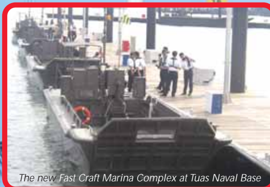
The new Fast Craft Marina Complex at Tuas Naval Base