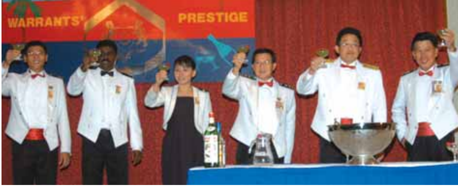
Proposing a toast to the new Warrant Officers!

NINE RSN specialist and nine NSmen were recently promoted to 2nd Warrant Officers after successfully completing the 29th Joint Warrant Officer Course (JWOC) and National Servicemen Warrant Officer Course (NSWOC) respectively, at a ceremony held at the Orchid Country Club on 23 Jun. The 29th JWOC and NSWOC candidates attended the course at SAFWOS from 10 May to 30 Jun. Chief of Defence Force, LG Ng Yat Chung, presented book prizes to selected winners.