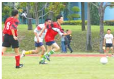
Full steam ahead team!