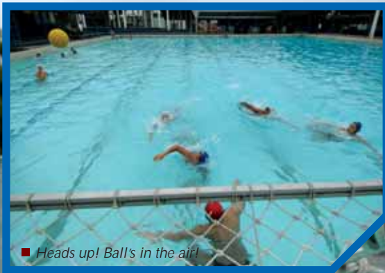
■ Heads up! Ball's in the air!