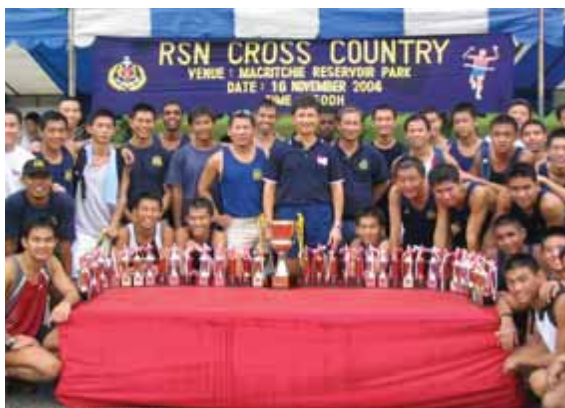
■ Winners all!