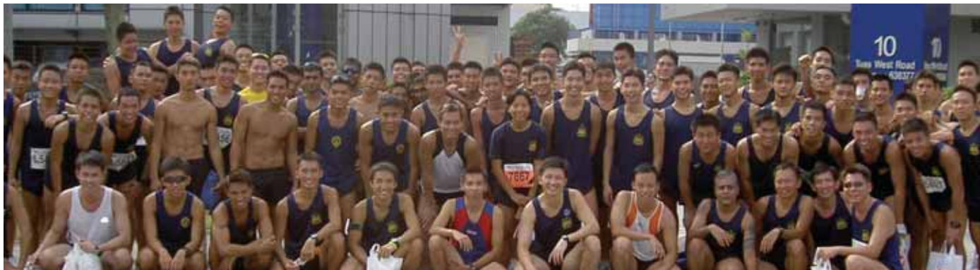
■ Great run!