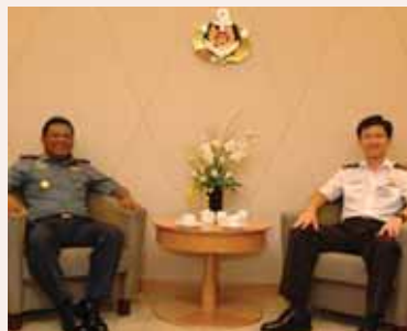
■ Rear Admiral Didik Heru Purnomo Commander, Western Fleet Indonesian Navy