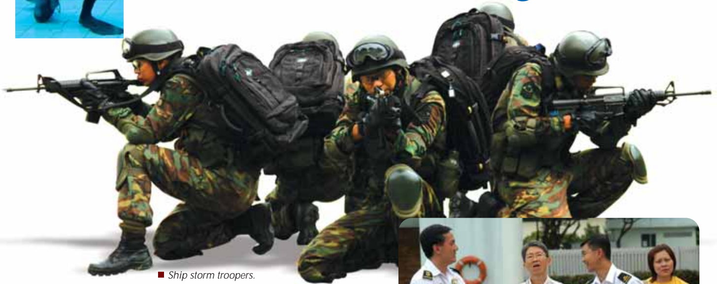
■ Ship storm troopers.