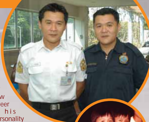
Look how they have grown...

With such go-go attitudes, twin peaks of adventures and achievements beckon for these two aspiring naval specialists, for sure.