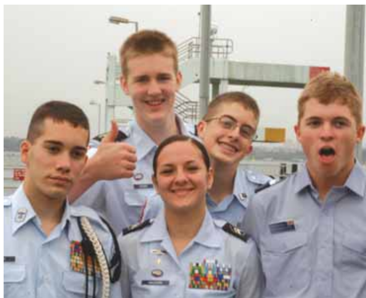
■ Thumbs Up visit from Down Under!

ABOUT 200 National Cadet Corp (NCC) cadets visited the RSN as part of their annual Camp Pinnacle on 7 Dec. The cadets, which included members from India and Australia, visited the Naval Diving Unit (NDU) and Changi Naval Base (CNB) to enhance their