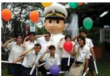
◀ Back Page: Text by MAJ Irvin Lim