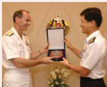
■ Vice Admiral Johnathan W. Greenert Commander U.S. Seventh Fleet United States Navy