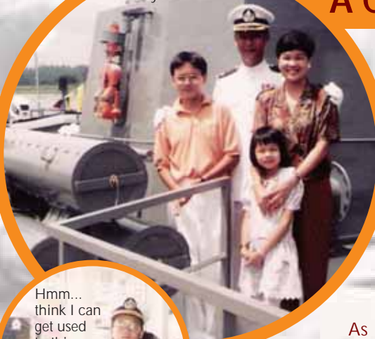
Family all onboard!

As we enter the year-end season of festive celebrations and family get-togethers, Navy News thought it timely to catch up with some real-life navy families and siblings working in the RSN to see what makes "blood thicker than seawater!"