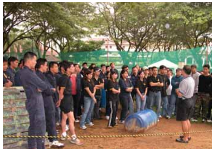
■ Does this look like a mine to you?

It was a joyous occasion as the COSCOM family engaged in a range of fun-filled activities. A bowling competition was held which saw the participation from the various units and Squadrons in COSCOM. The more adventurous participated in the Paintball competition which saw much 'combat