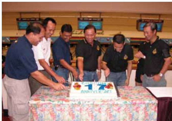
■ Happy Birthday COSCOM!