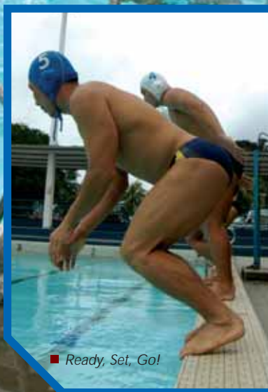
■ Ready, Set, Go!