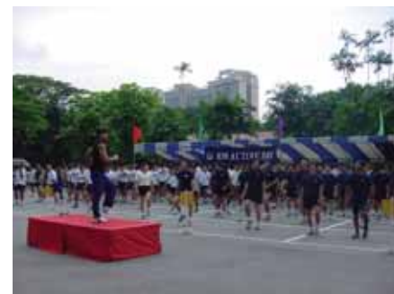
■ Kickboxers bend those knees.

In the midst of the cross-country competition, the mass participants of the