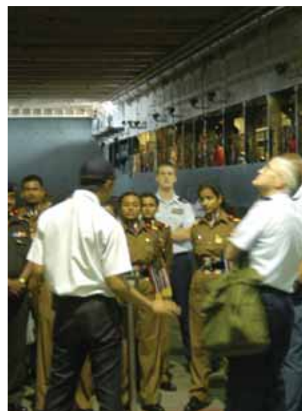
■ Briefing in the belly of the LST.