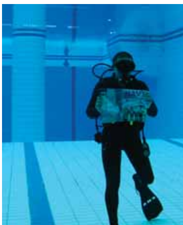
◀ Cover Photo: Picture by 3SG Gerald Neo